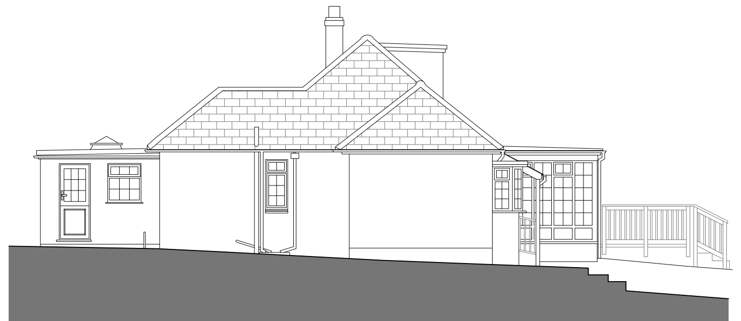
EXISTING SIDE (NW FACING) ELEVATION