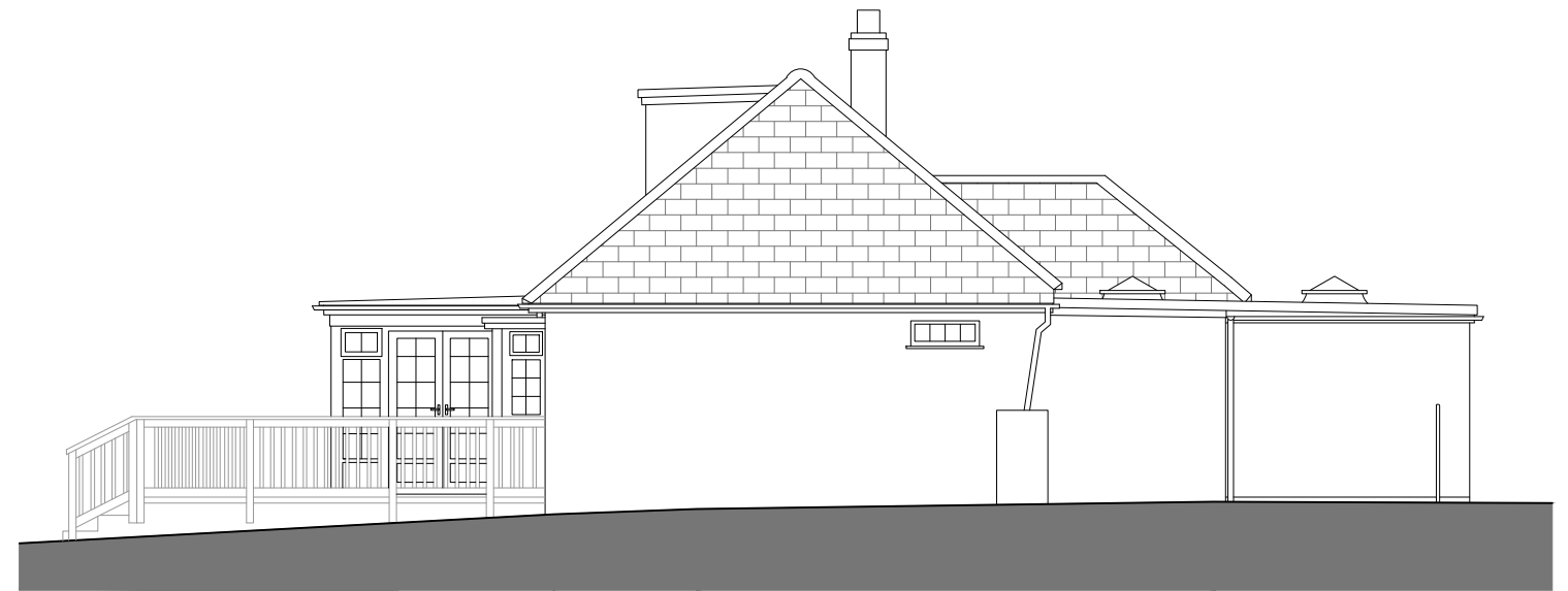
EXISTING SIDE (SE FACING) ELEVATION