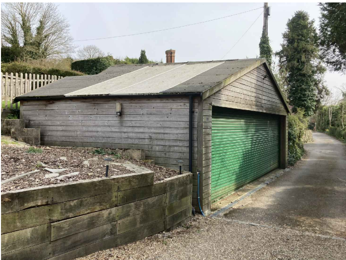
BLUBELLS - GARAGE