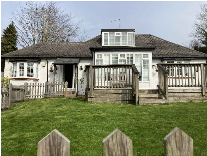
BLUBELLS - FRONT ELEVATION