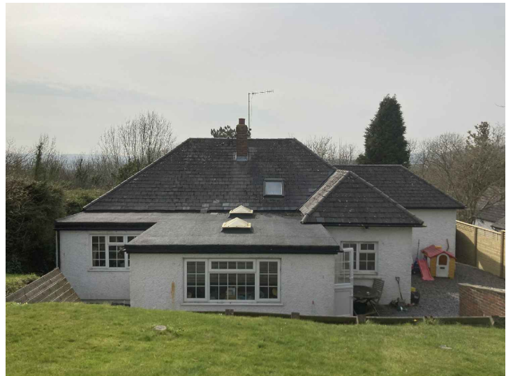
BLUBELLS - REAR ELEVATION