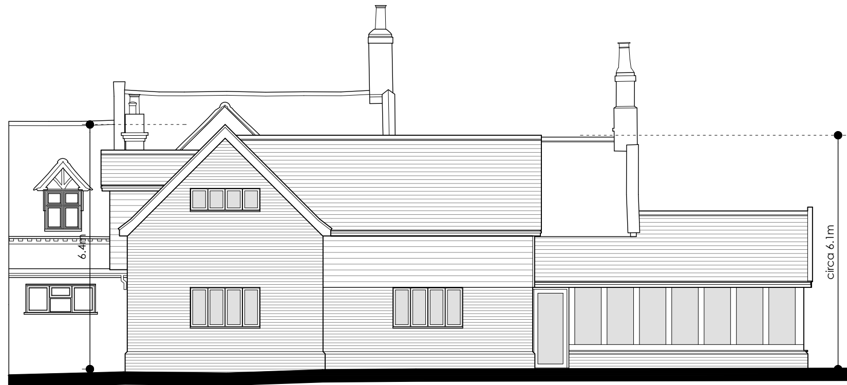
North (Rear) Elevation 1:100