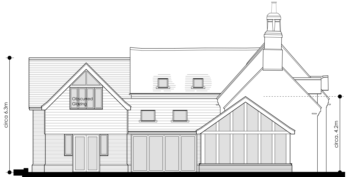
West (Side) Elevation 1:100