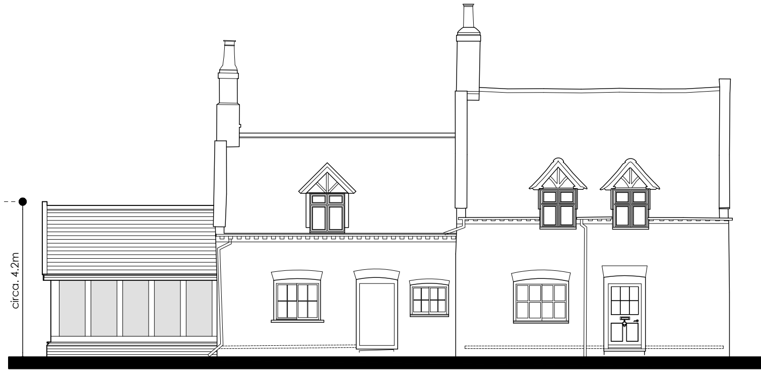
South (Front) Elevation 1:100