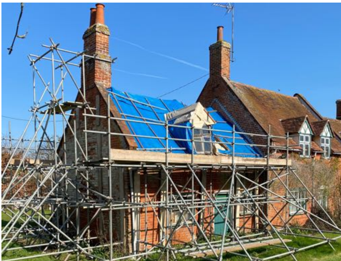
Image 3. South (Front) Elevation (March 2022). This image shows No. 24 is in a significant state of disrepair and will require a large element of reconstruction, The building has been 'propped' to avoid total collapse however, the built structure continues to deteriorate. This is clearly visible there the lead flashing meets no. 23 illustrating how much the roof has 'dropped'.