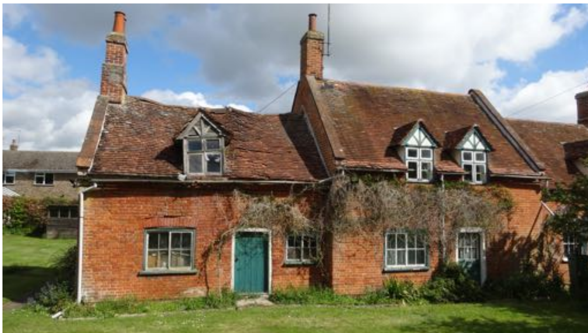
Image 2. South (front) elevation (May 2021). Image of the principle elevation showing the 2 no. structures visible with 23 having a higher ridge and is still habitable. No. 24 is derelict and is not habitable in its current form.