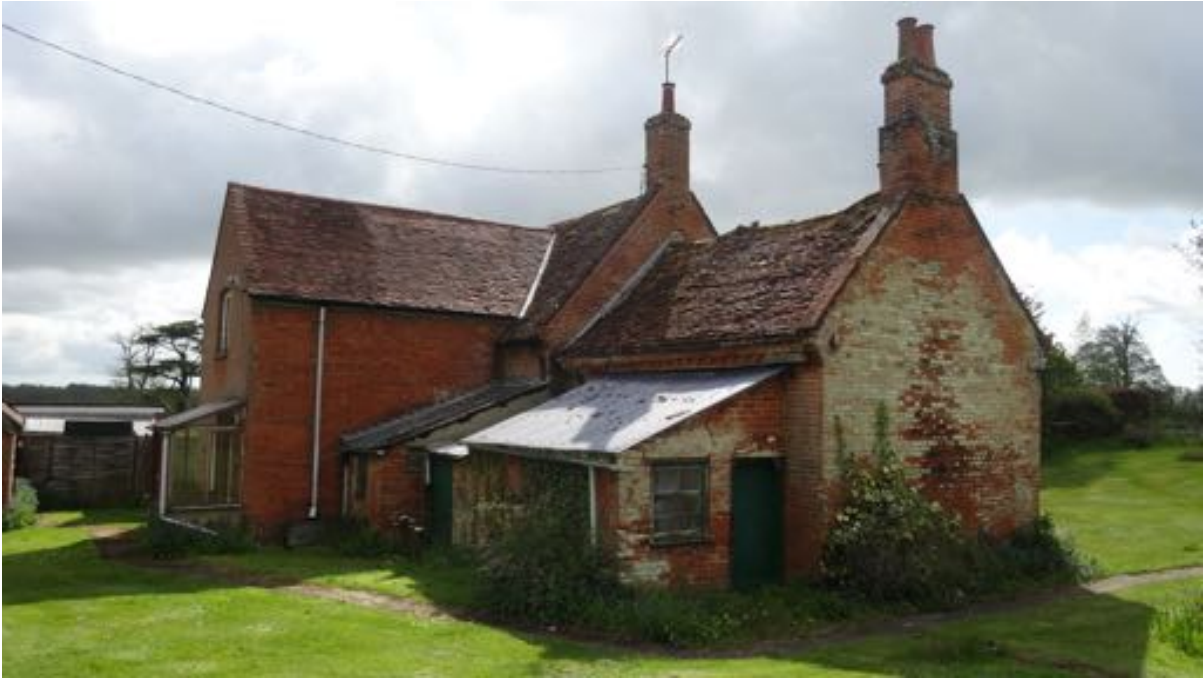
Image 4. West Elevation (May 2021). This images shows both 23 & 24 with the single storey lean-to additional and the two storey extension to the rear of no. 24.