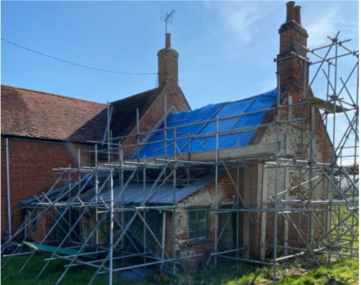
Image 5. West Elevation (March 2022). This image shows both 23 & 24 with the single storey lean-to additional and the two storey extension to the rear of no. 24. As with image 3, this clearly shows the significant deterioration over the past 10 months