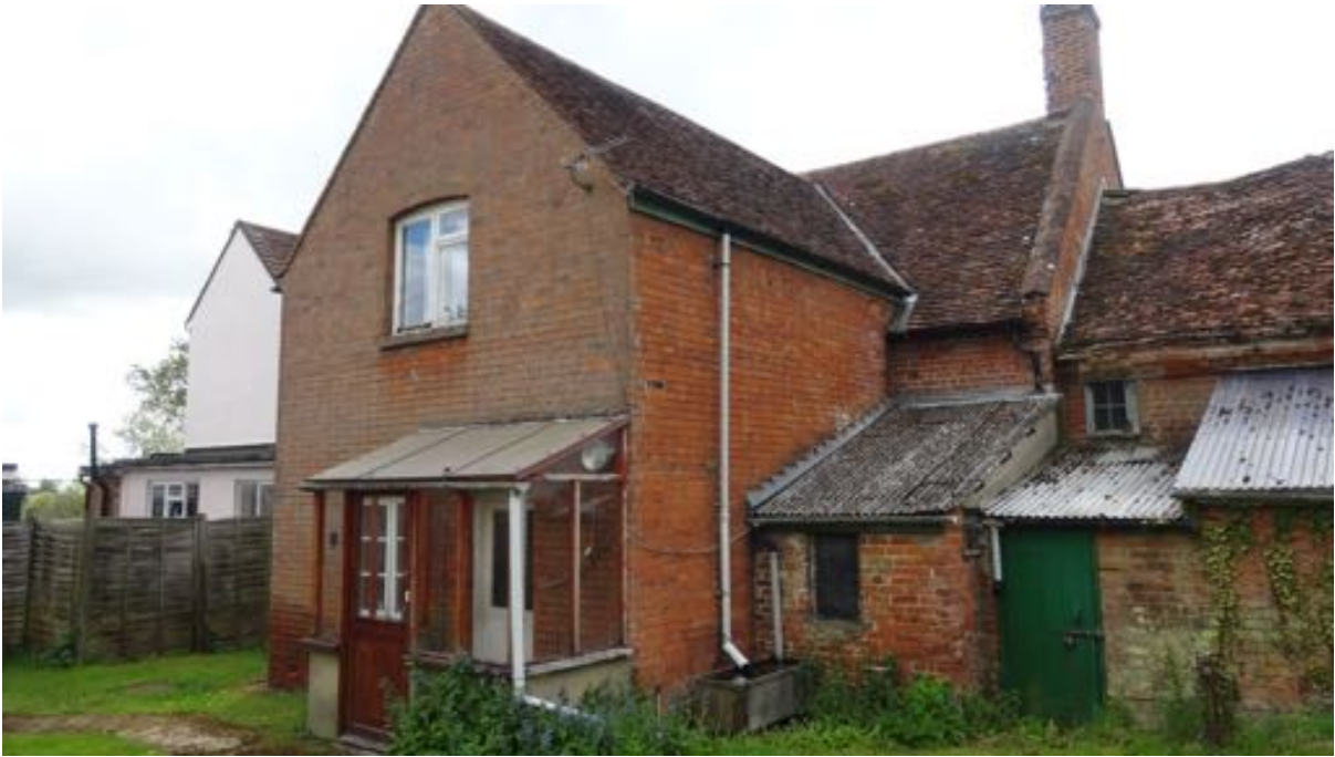
Image 6. North Elevation (May 2021). This shows the latter addition 2 storey rear extension to the rear of no. 23 along with the single storey lean-to additions to the rear of both 23 & 24.