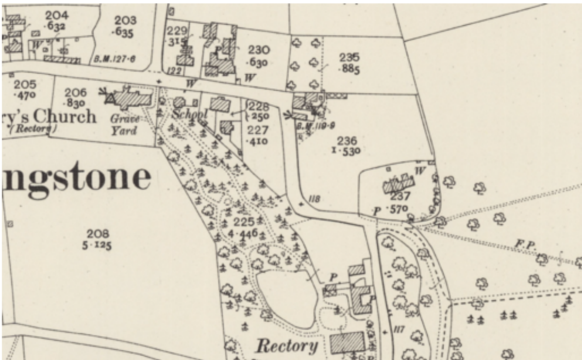
Fig 2. Ordnance Survey '25 inch' Map 1904