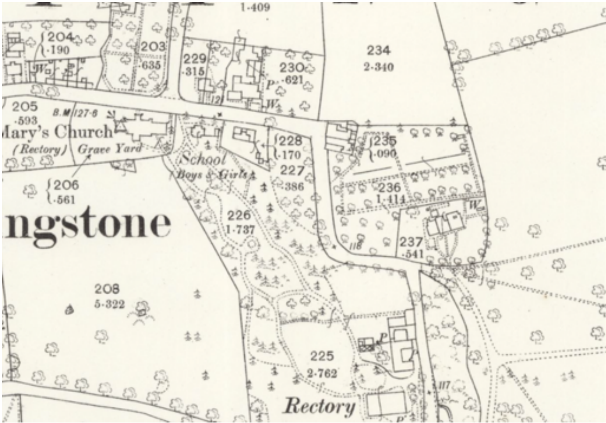
Fig 1. Ordnance Survey '25 inch' Map 1882