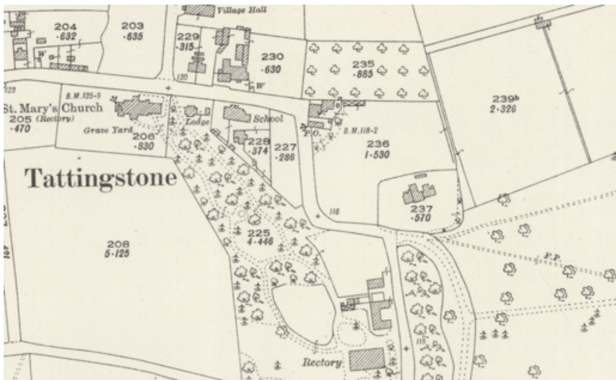
Fig 3. Ordnance Survey '25 inch' Map 1926