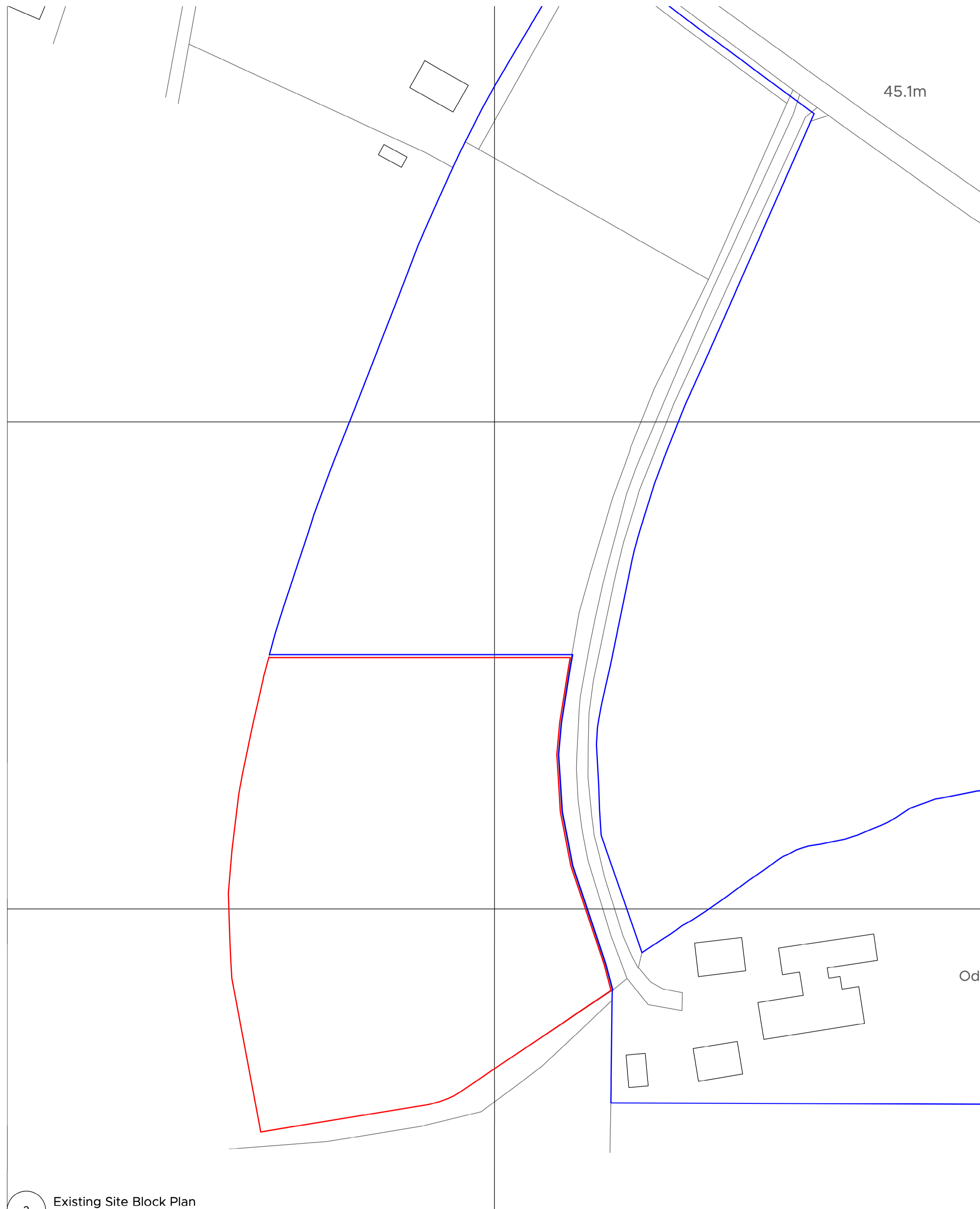
2 Existing Site Block Plan Scale: 1:500