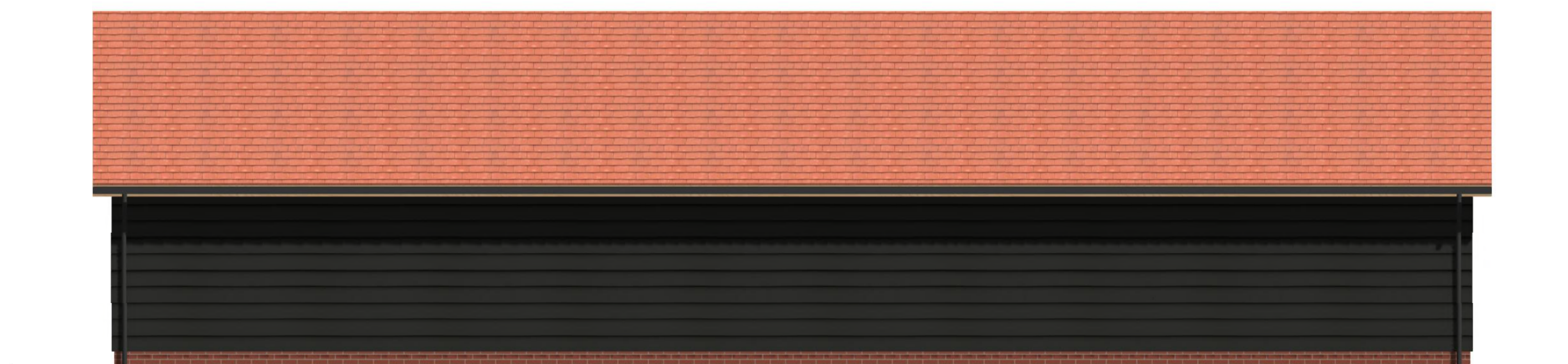
2 Southeast (Rear) Facing Elevation Scale: 1:50