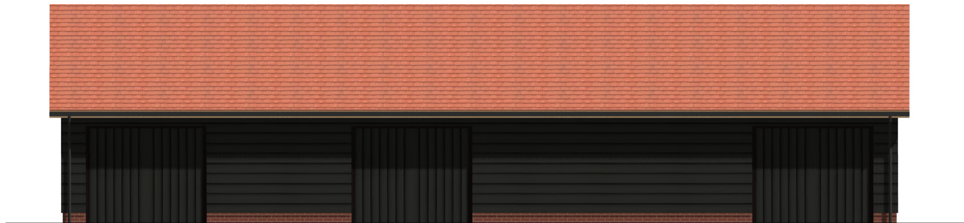
3 Northwest (Front) Facing Elevation Scale: 1:50