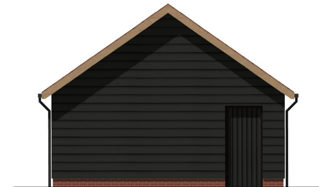
5 Northeast (Left) Facing Elevation Scale: 1:50