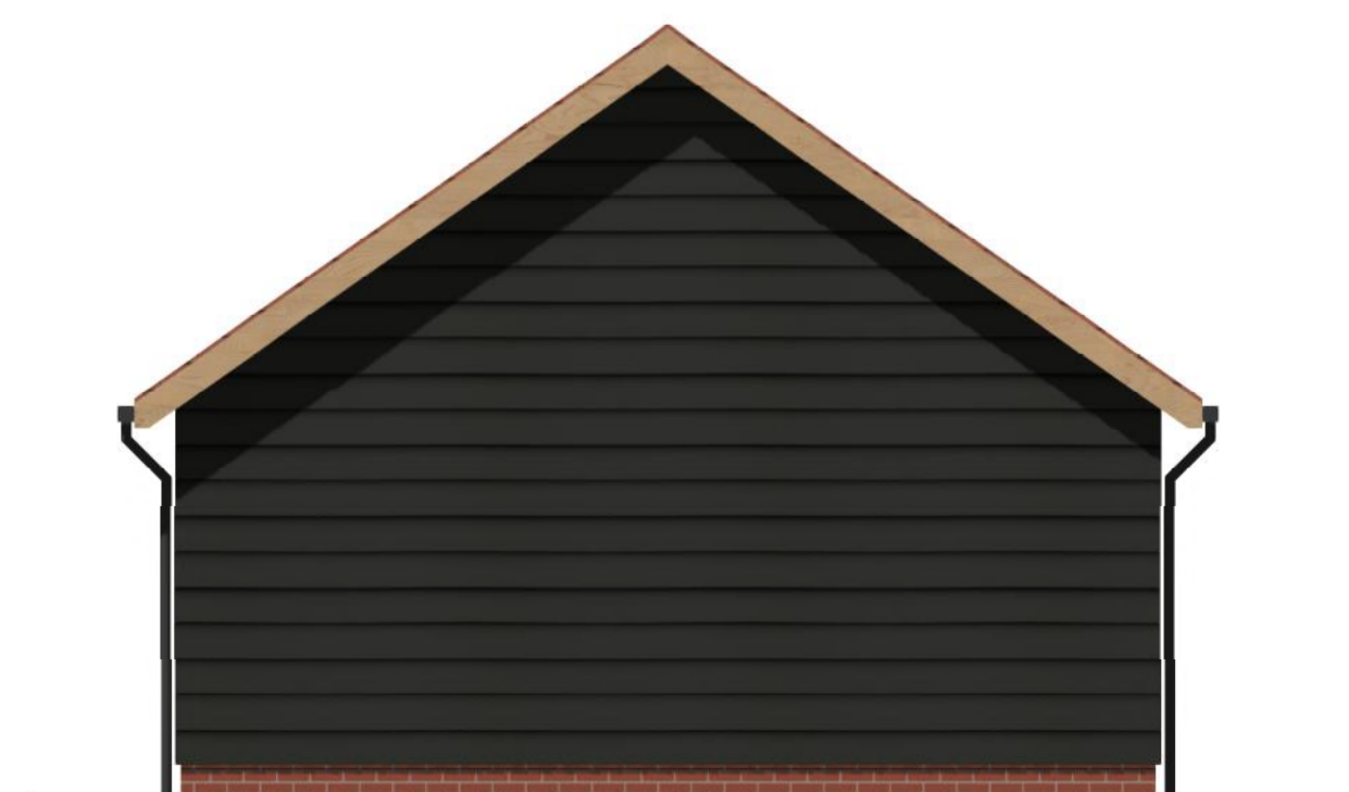
4 Southwest (Right) Facing Elevation Scale: 1:50