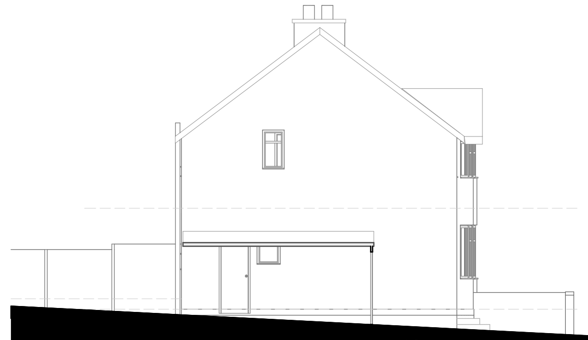
SIDE (TWO) ELEVATION