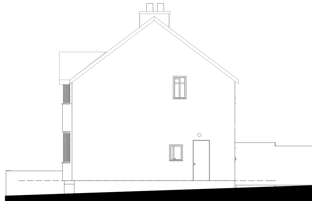
SIDE (ONE) ELEVATION