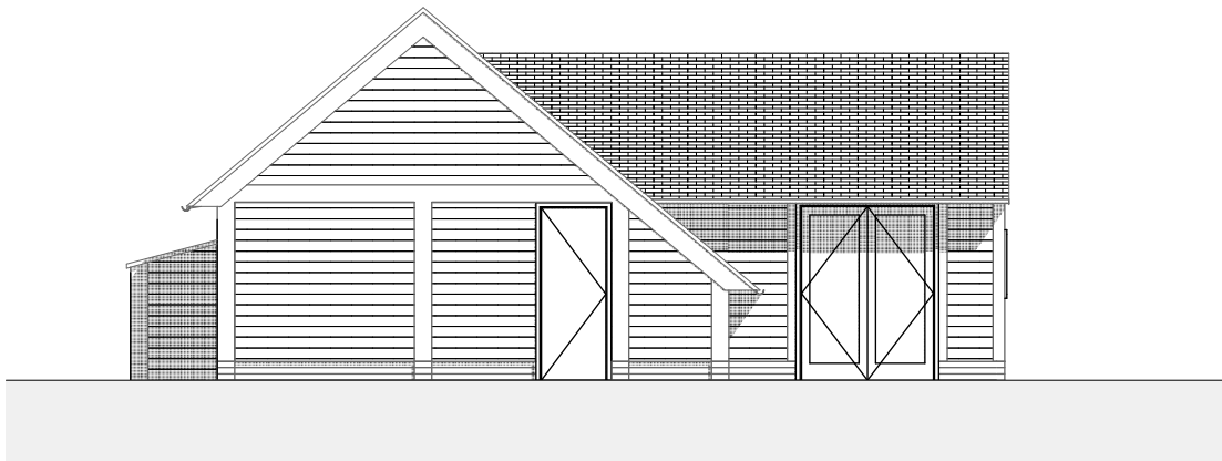
2 Side Elevation One 1:100