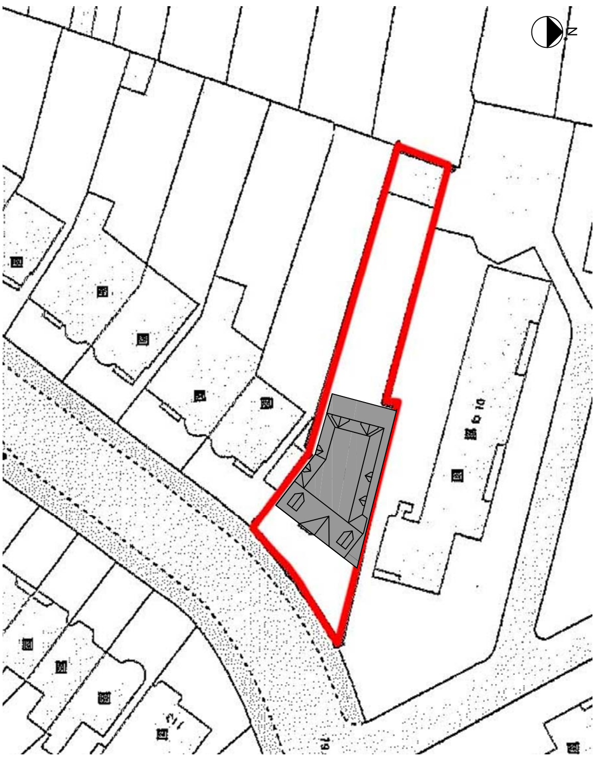
PROPOSED BLOCK PLAN SCALE 1:500 @ A3