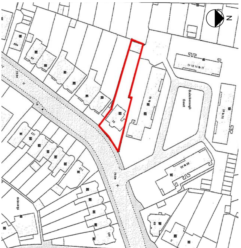
SITE LOCATION PLAN SCALE 1:1250 @ A3