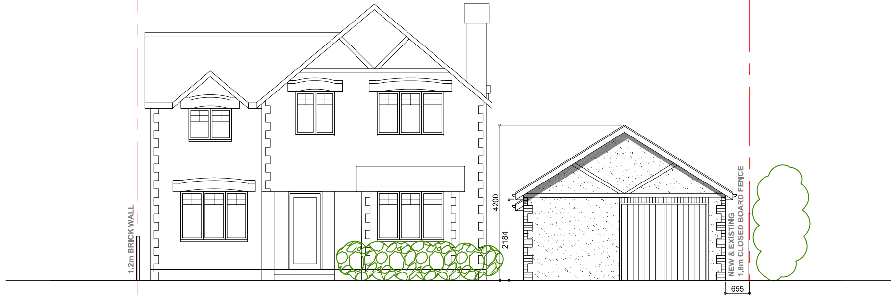
PROPOSED SOUTH-WEST ELEVATION TO WOODLANDS ROAD

and prepared for submission as part of any statutory Applications. It is not intended for use by any other person or for any other building project or purpose without prior permission from Toldfield Architects Ltd.