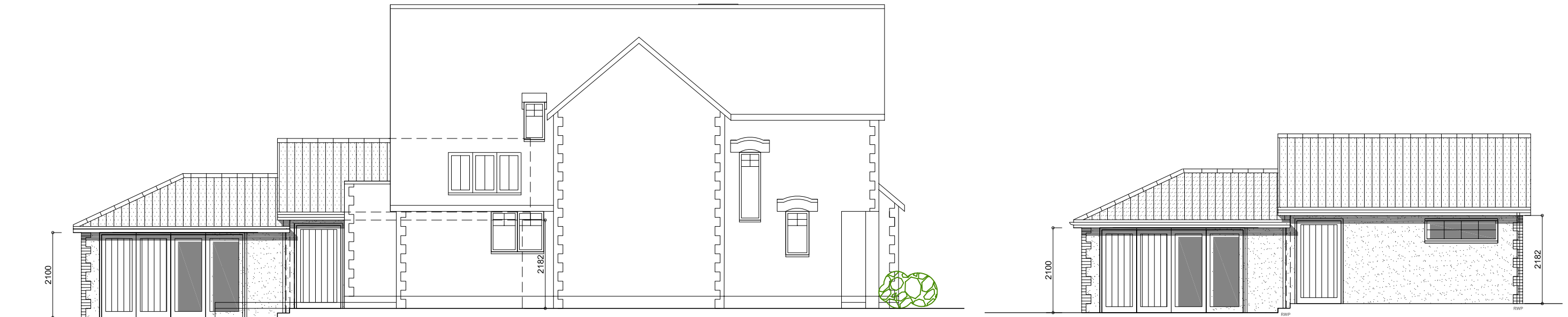
PROPOSED REPLACEMENT GARAGE & WORKSHOP NORTH-WEST ELEVATION