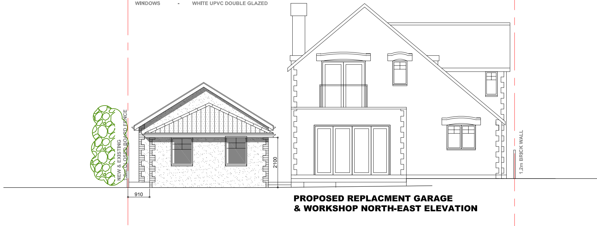
PROPOSED REPLACEMENT GARAGE & WORKSHOP NORTH-EAST ELEVATION

and prepared for submission as part of any statutory Applications. It is not intended for use by any other person or for any other building project or purpose without prior permission from Toldfield Architects Ltd.