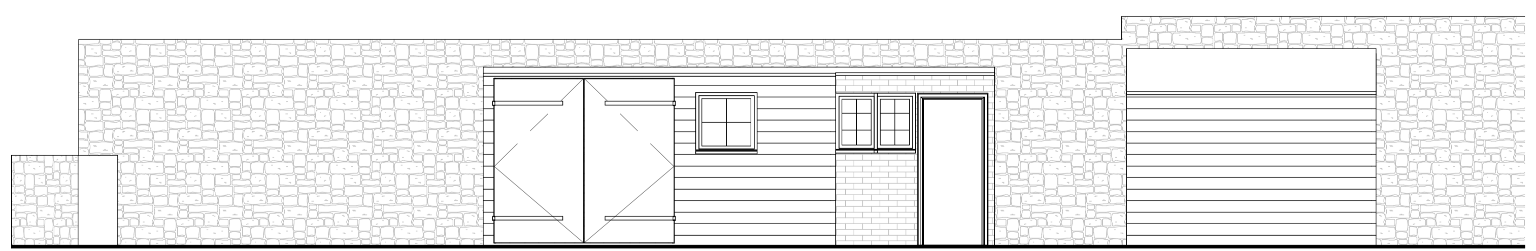
2 01.A1 EXISTING FRONT ELEVATION 1 : 50