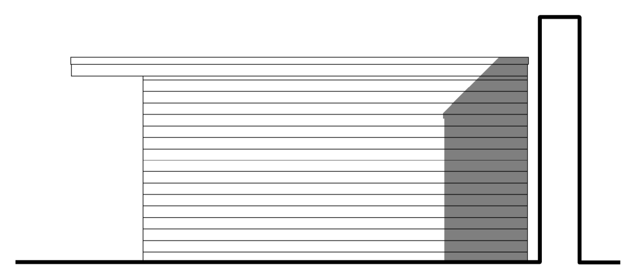
4 02.A1 PROPOSED EAST ELEVATION 1 : 50