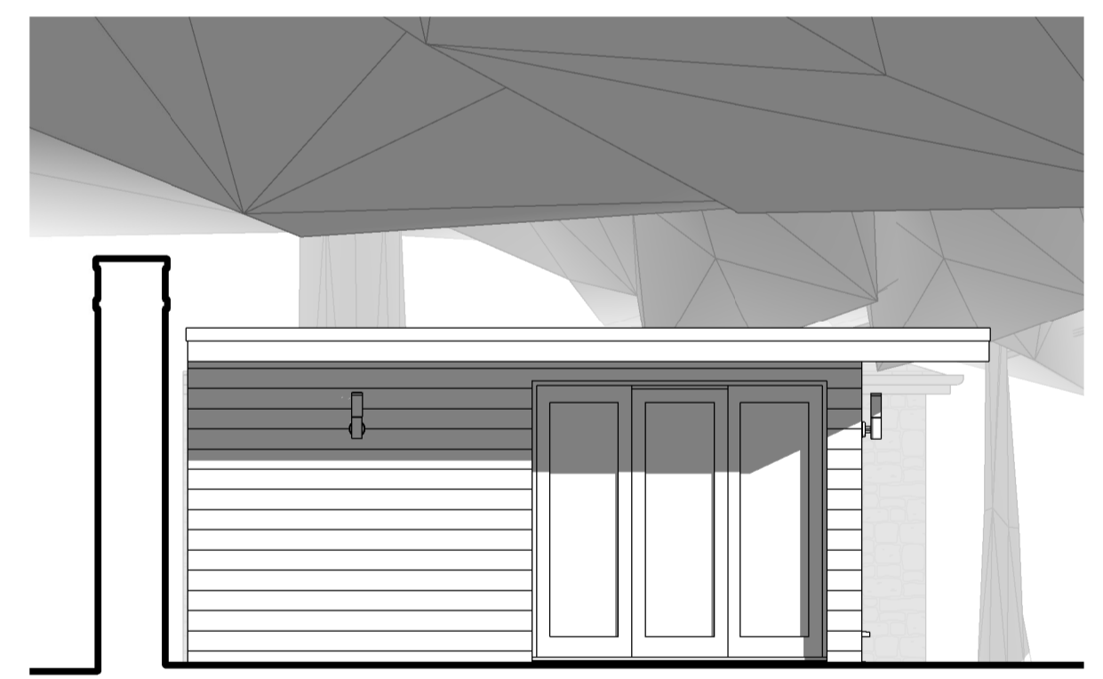
3 02.A1 PR_WEST ELEVATION 1 : 50