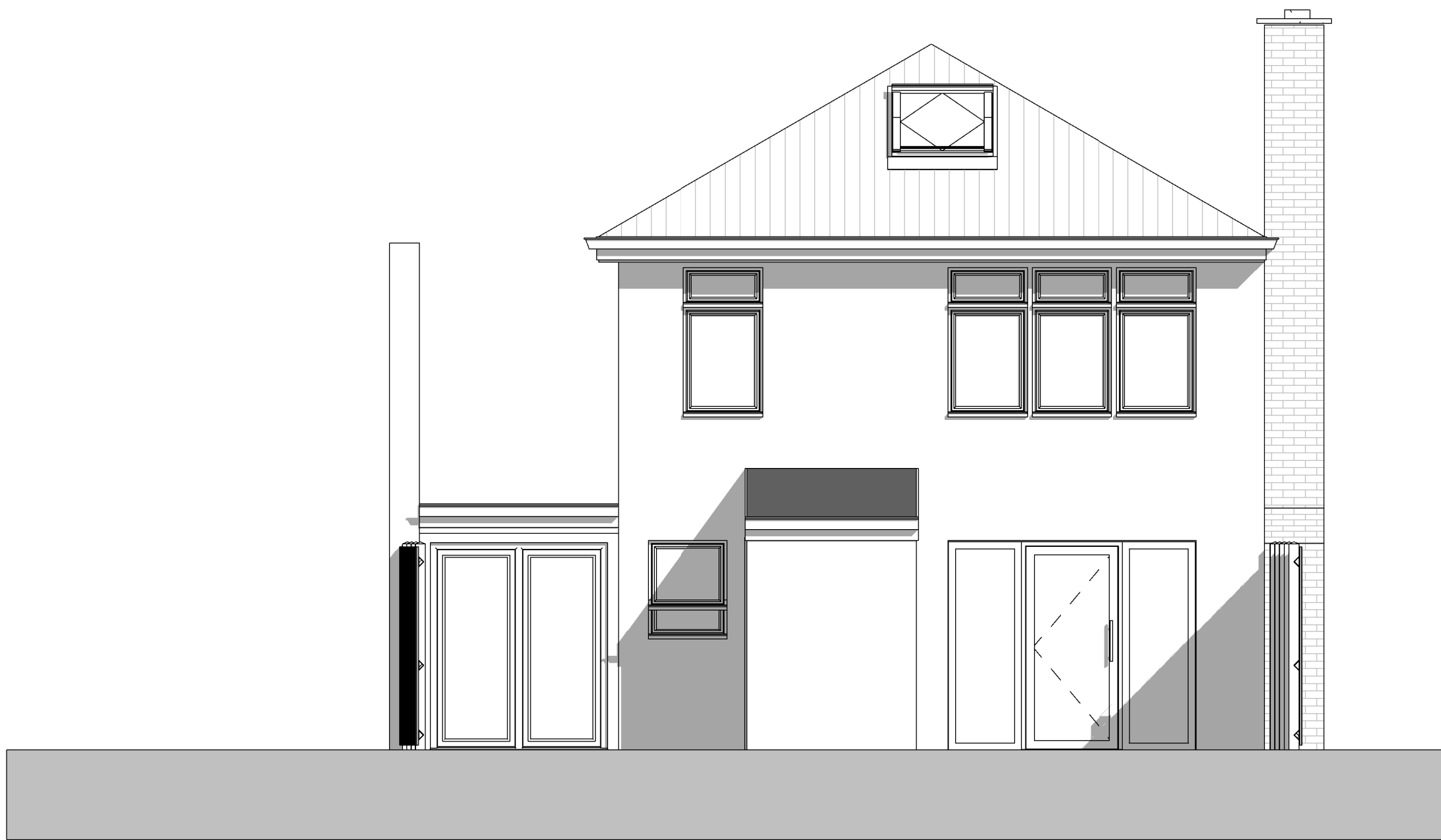
2 00 - REAR ELEVATION 1 : 50