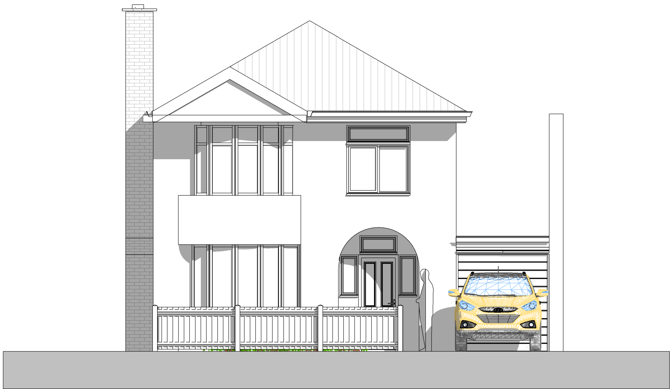
1 00 - FRONT ELEVATION 1 : 50