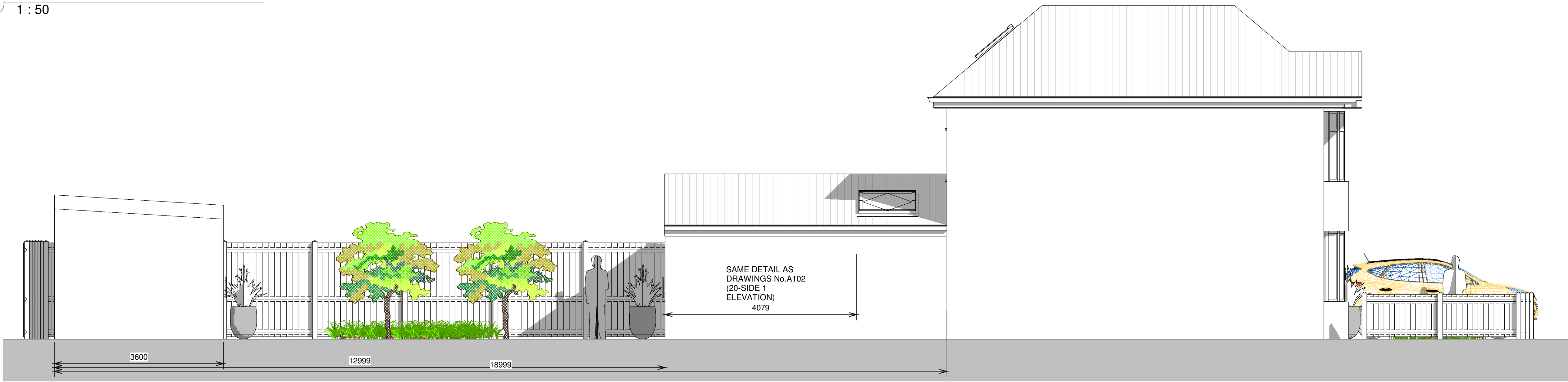
4 20 - SIDE 2 ELEVATION 1 : 50

General Drawings prepared for local authority. Any electrical, heating installation, joinery items, finishes, and fittings to be instructed by the client. The clients are to satisfy themselves that any buried private or public services will not affect the proposal. These drawings have been prepared on the understanding that work will not commence on site prior to the granting of planning permission and building Reg approval. All drawings are copyright and may not be used in conjunction with other projects. ALL MEASUREMENTS ARE GIVEN AS APPROXIMATE AND MUST BE CHECKED ON SITE PRIOR TO WORKS STARTING. THEY ARE DRAWN IN MILLIMETERS. CDM REG 2015 These drawings have been prepared on the understanding that work will not commence on site prior to the granting of planning permission and building Reg approval. At this point the designers work is complete; hence the designer of this drawing will not be acting as the principal designer in terms of health and safety. Under the new regulations, both the client and the building contractor will have health and safety responsibilities and will need to prepare a construction phase plan for the scheme. The construction phase plan for the scheme should include risk assessment and method statements for elements of the works such as excavations, buried services, risk of electrocution, working at height, lifting and handling, etc. should you require guidance, please see HSE website.