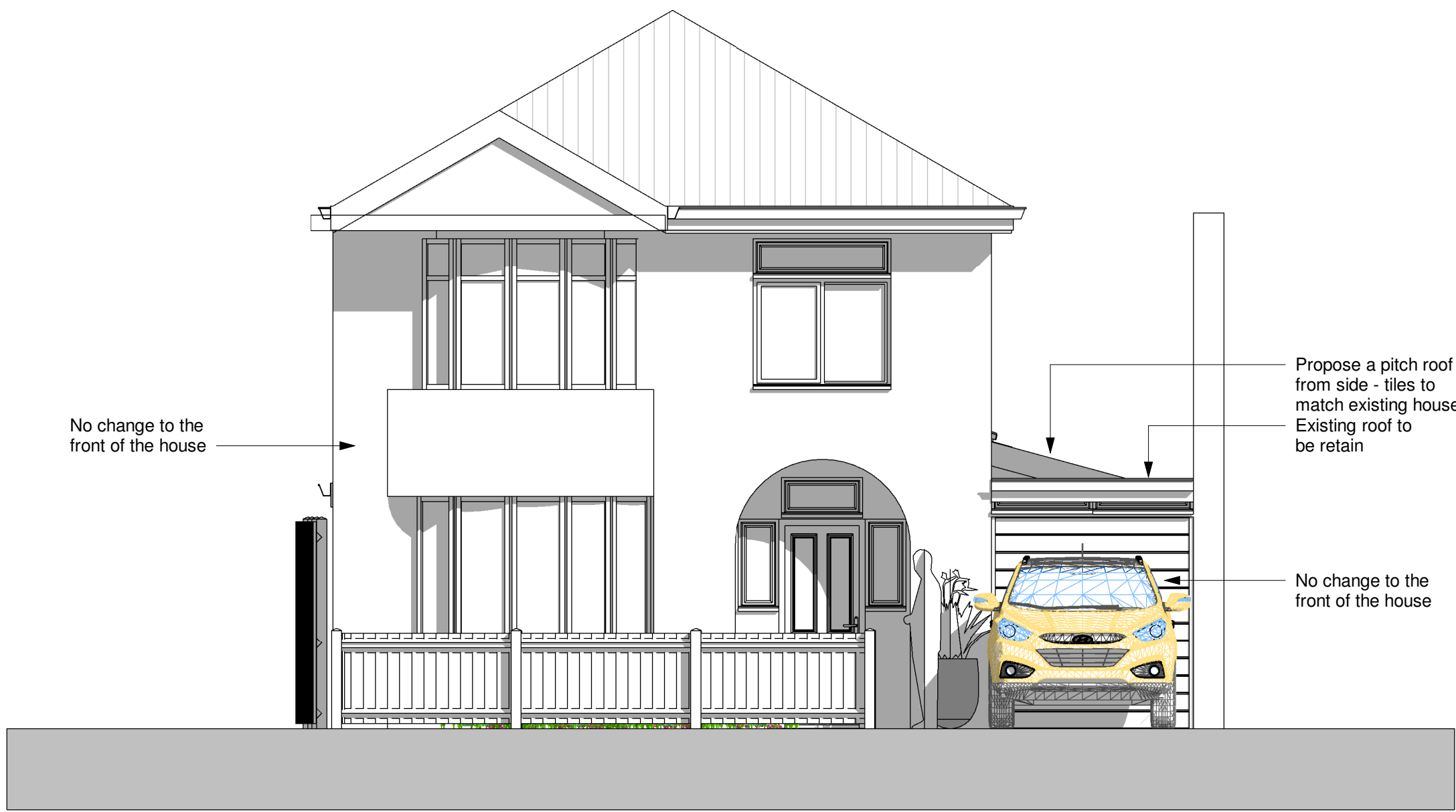
1 20 - FRONT ELEVATION 1 : 50