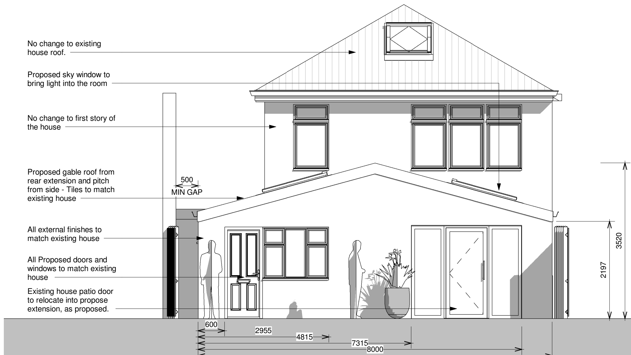
2 20 - REAR ELEVATION 1 : 50