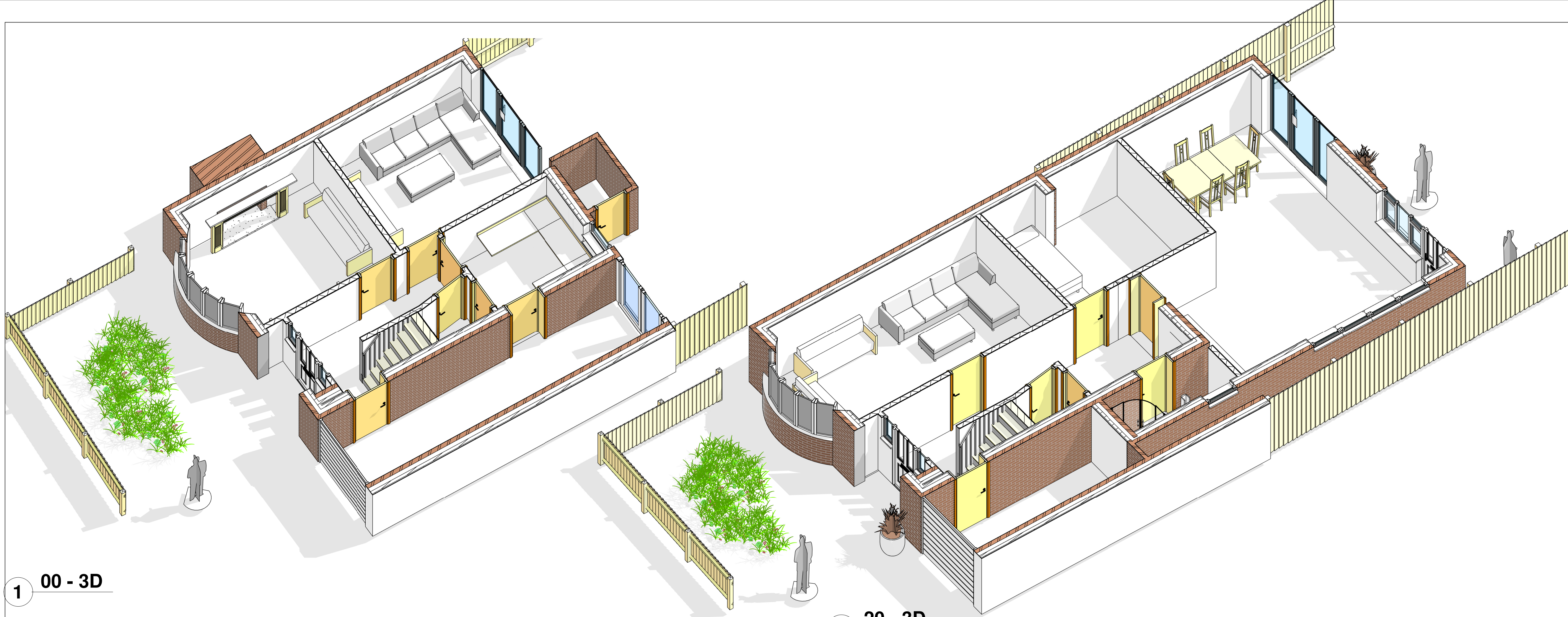
1 00 - 3D