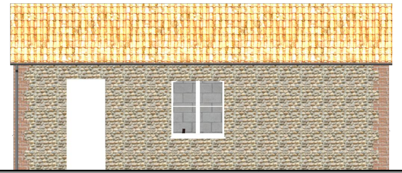
SOUTH ELEVATION 1:50