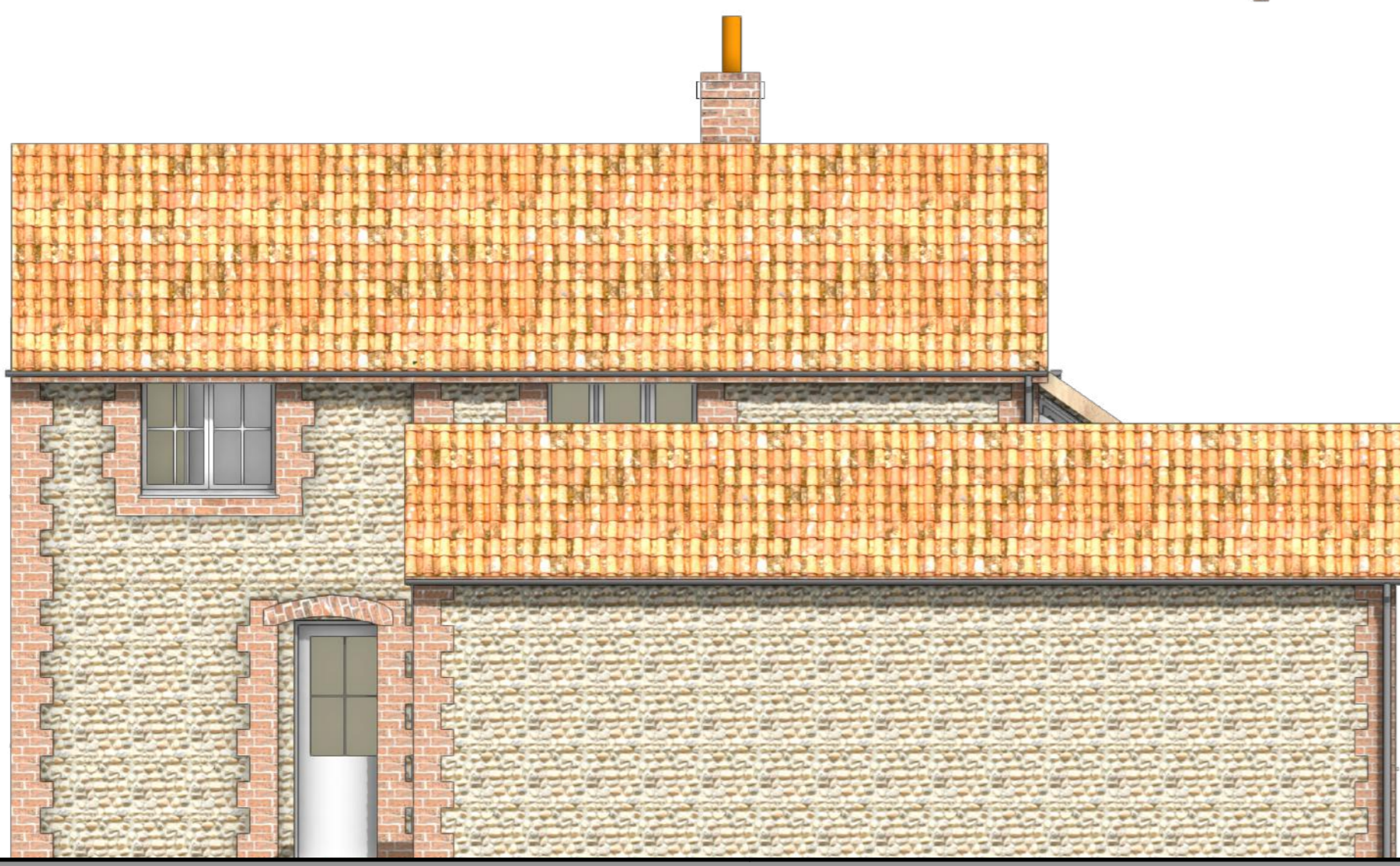
NORTH ELEVATION 1:50