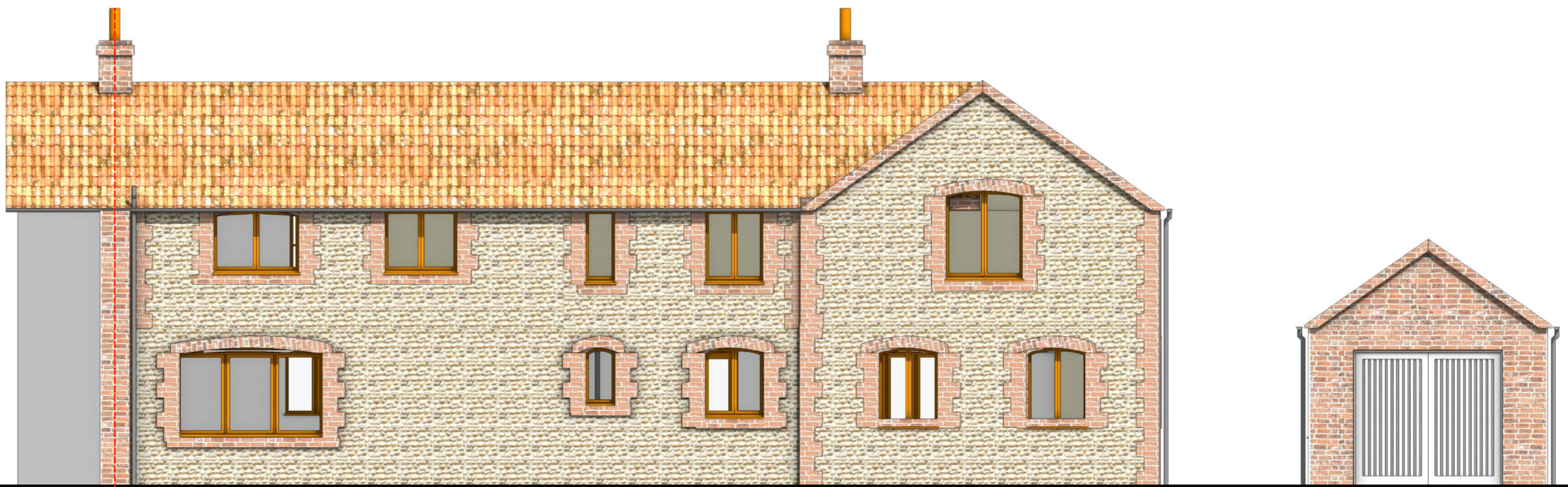
EAST ELEVATION 1:50