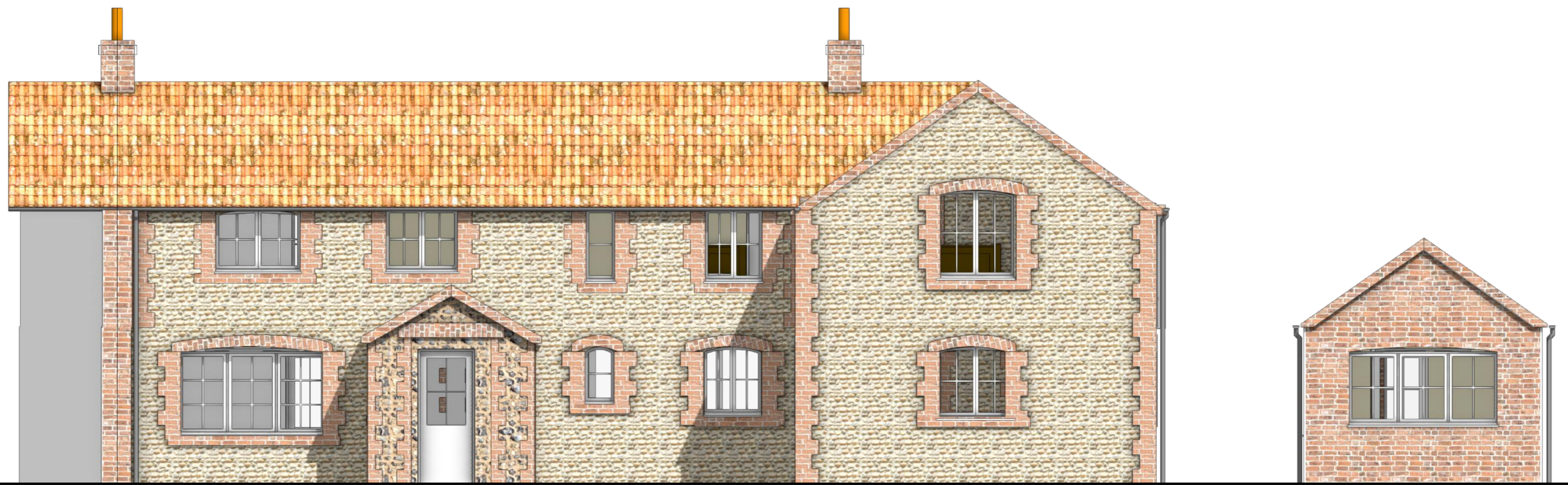
EAST ELEVATION 1:50