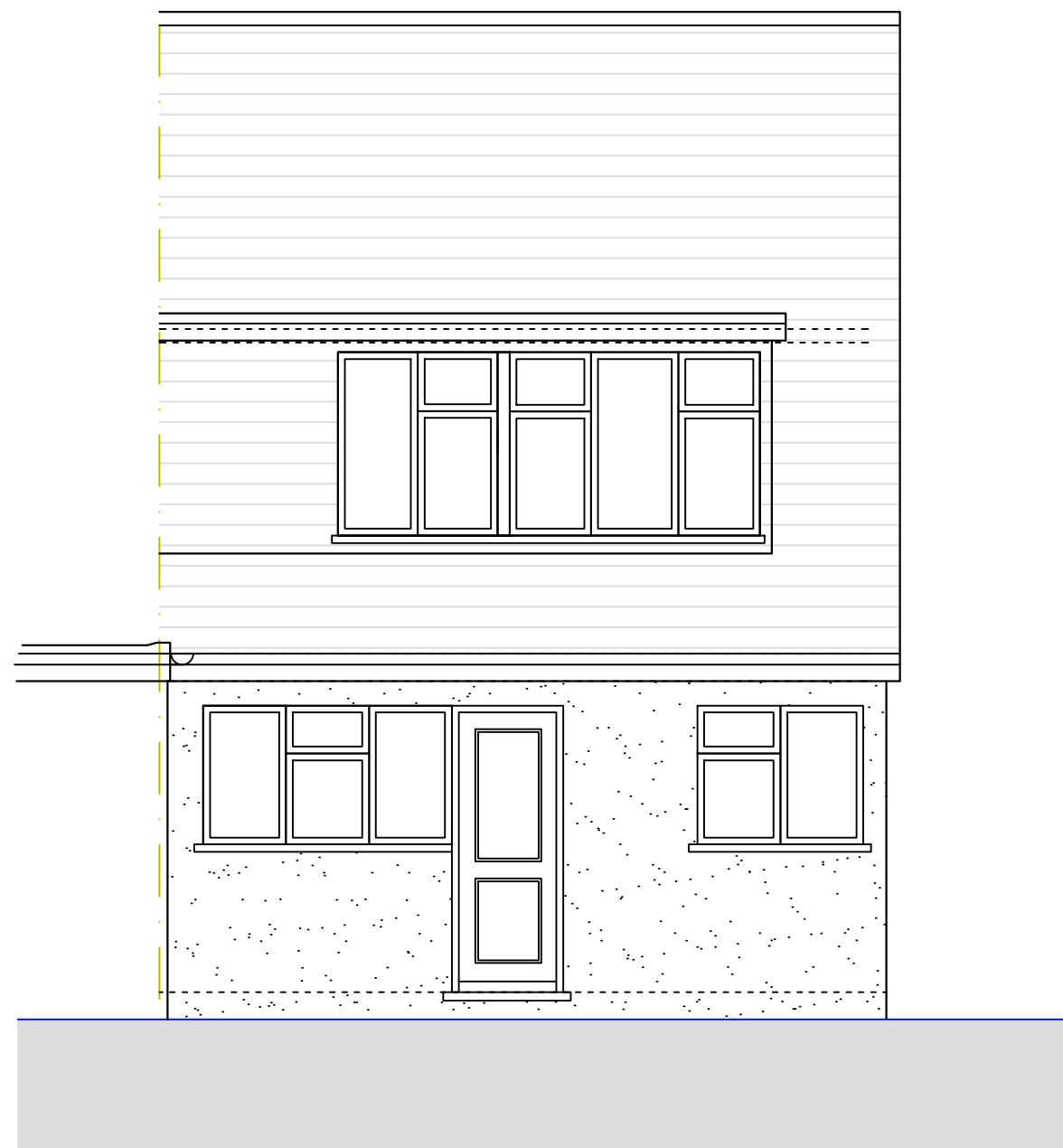
○ Rear Elevation 1:50