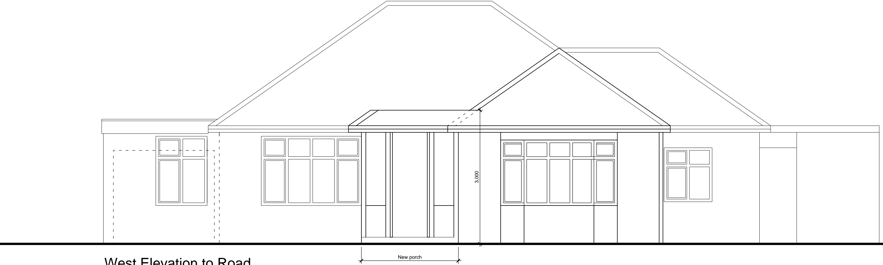
West Elevation to Road