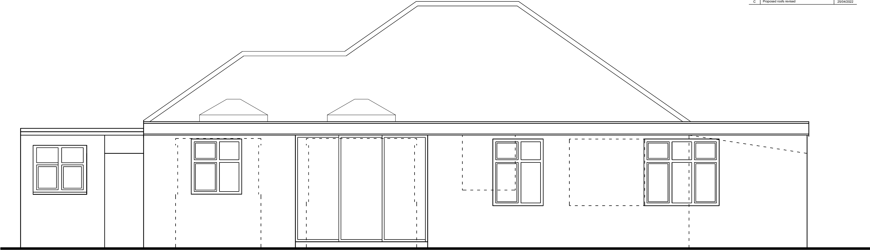
East Elevation to Garden