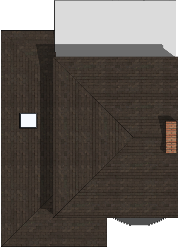
Proposed Roof Plan

DRAWING NOTES Whilst every care has been taken to ensure accuracy, no responsibility will be accepted by AJA Architectural Services for any errors contained in this drawing and it should not be relied upon for the ordering of any materials. All dimensions are to be checked on site prior to setting out or fabrication of any materials by the appointed contractor/builder. All drawings are to be read in conjunction with all relevant standards.