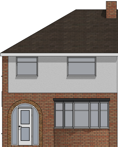
Existing Elevation - Front