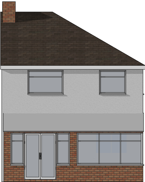
Existing Elevation - Rear