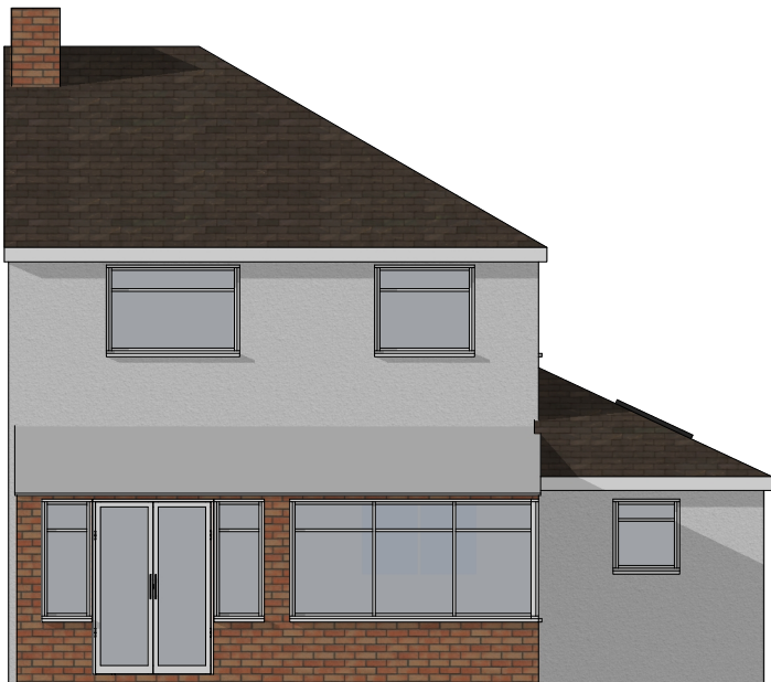
Proposed Elevation - Rear