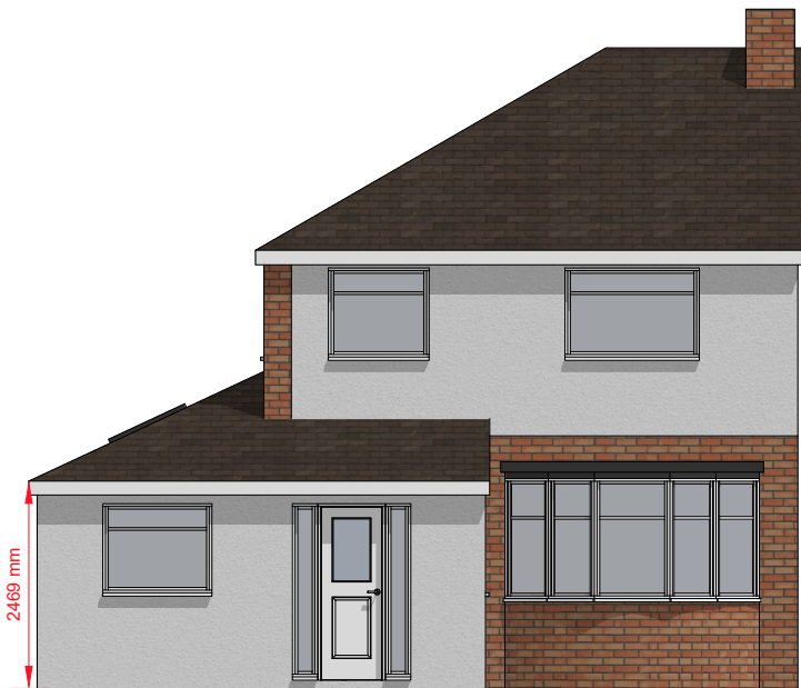
Proposed Elevation - Front