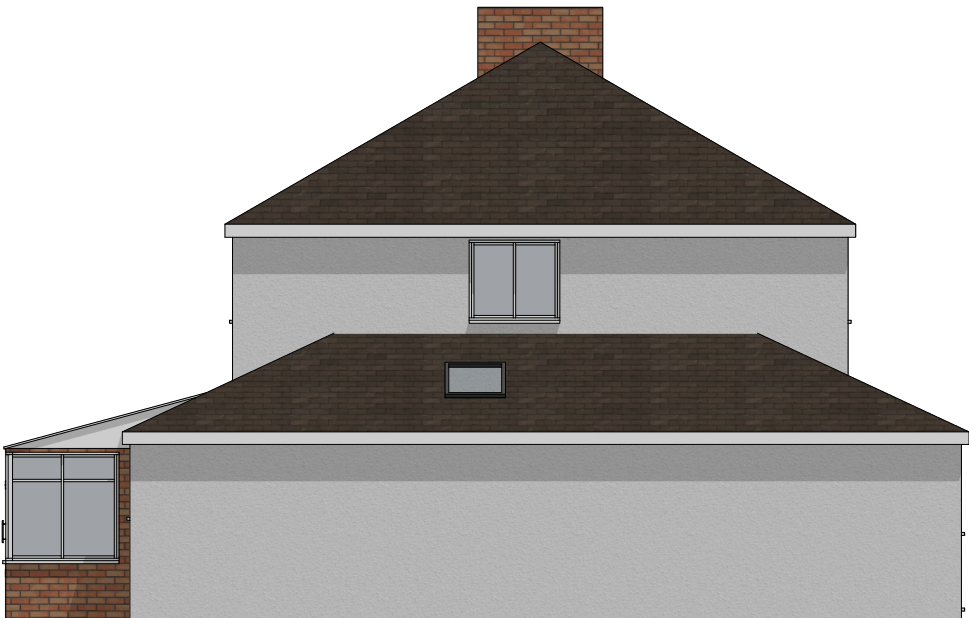
Proposed Elevation - LH Side

DRAWING NOTES Whilst every care has been taken to ensure accuracy, no responsibility will be accepted by AJA Architectural Services for any errors contained in this drawing and it should not be relied upon for the ordering of any materials. All dimensions are to be checked on site prior to setting out or fabrication of any materials by the appointed contractor/builder. All drawings are to be read in conjunction with all relevant standards.