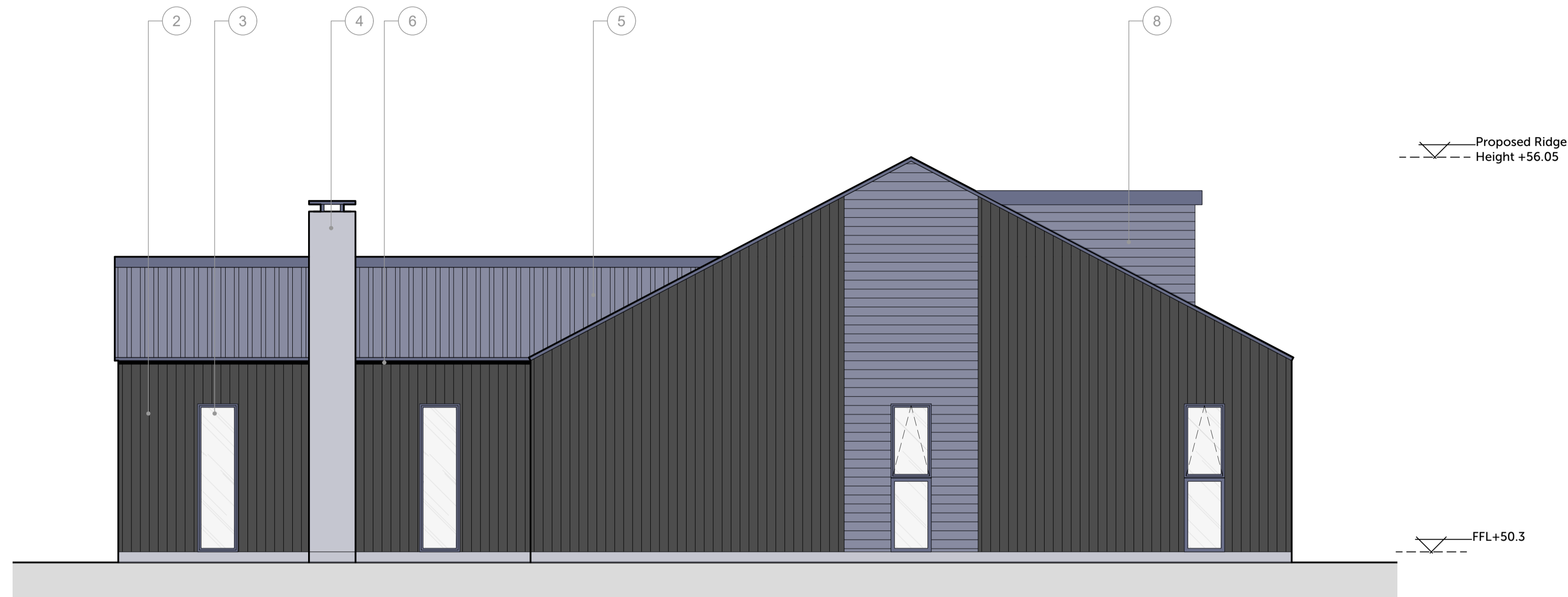
PROPOSED SOUTH ELEVATION 1: 50

GENERAL NOTES This drawing is to be read in conjunction with all relevant Engineers, Architects and specialists' drawings. Do not scale from this or any other Origin Design Studio drawing. All dimensions to be checked on site prior to construction or fabrication. Changes to specification are to contractors risk. All changes should be brought to the attention of the client/Building Control for approval. Please report any errors immediately.