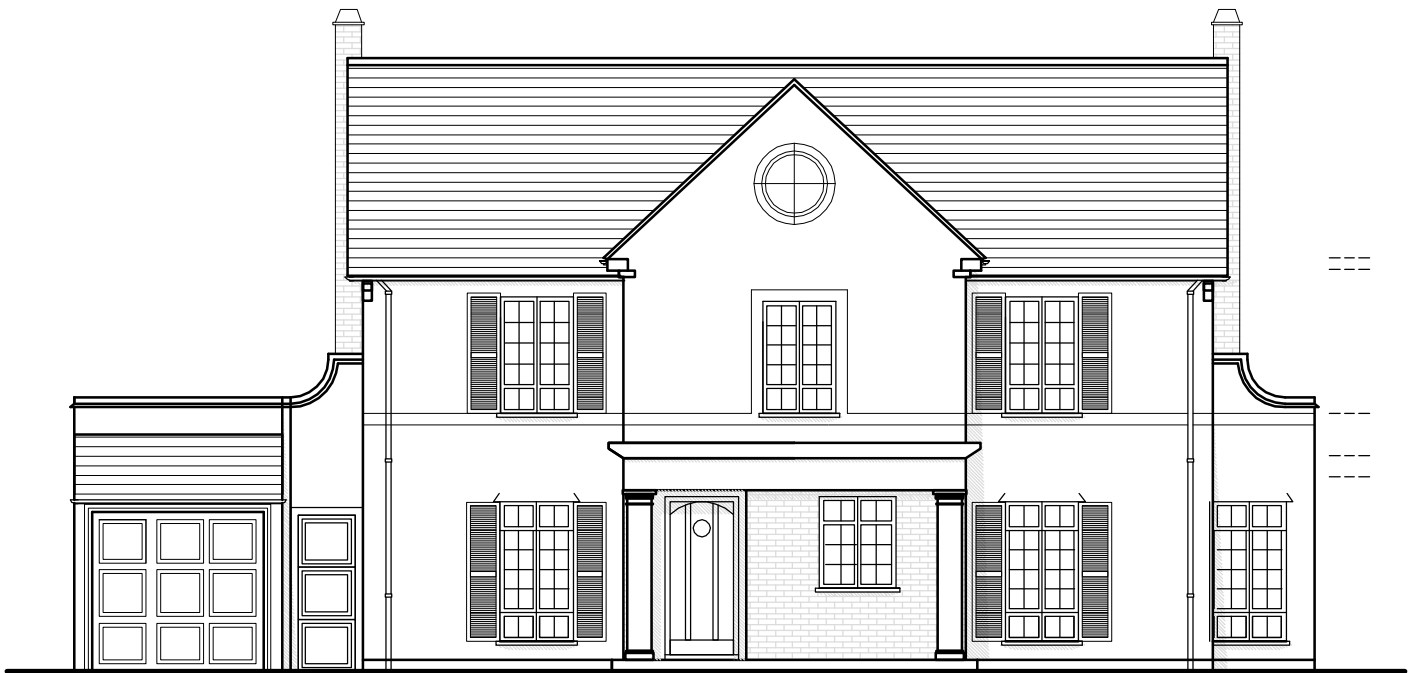
Front Elevation - Existing