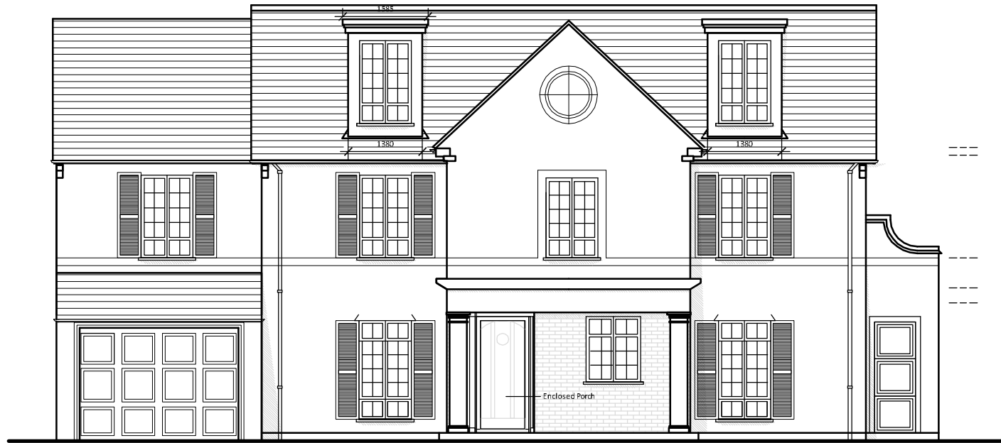
Front Elevation - Proposed