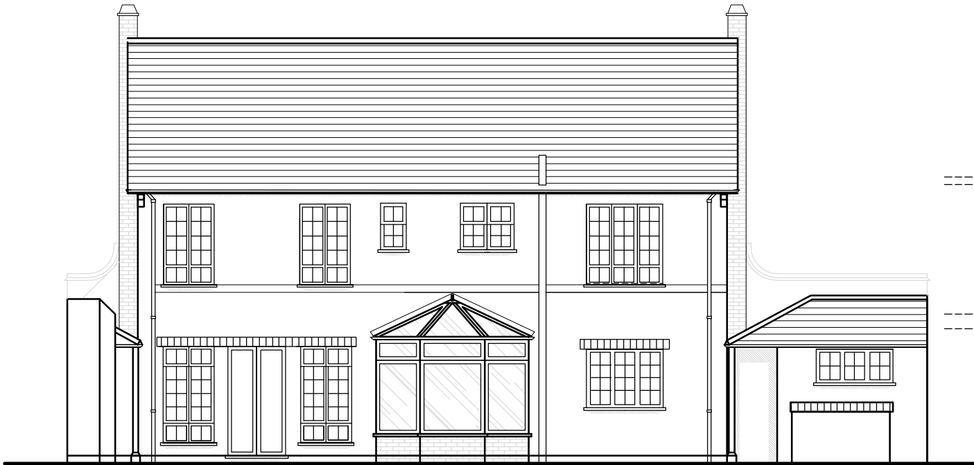
Rear Elevation - Existing