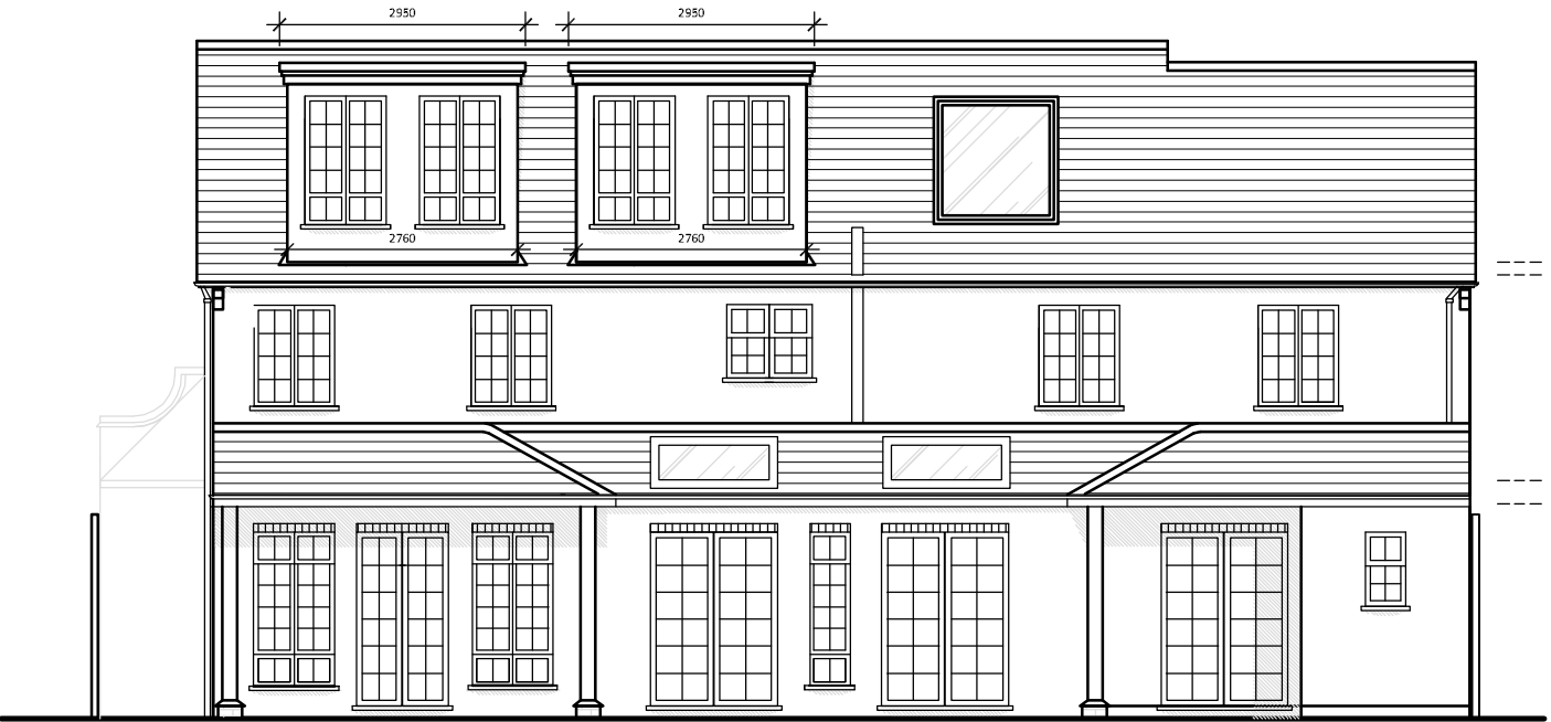
Rear Elevation - Proposed