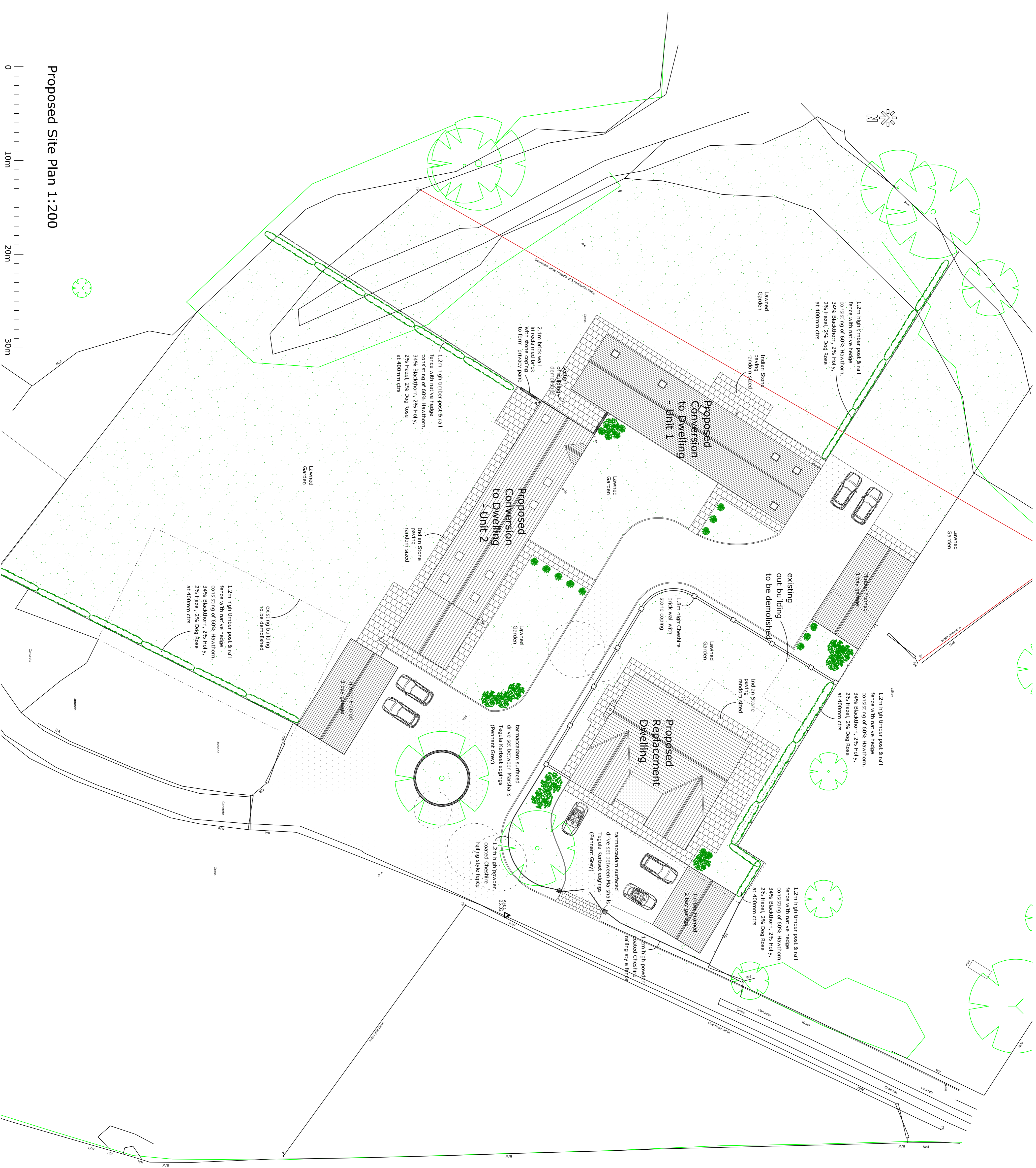
Proposed Site Plan 1:200