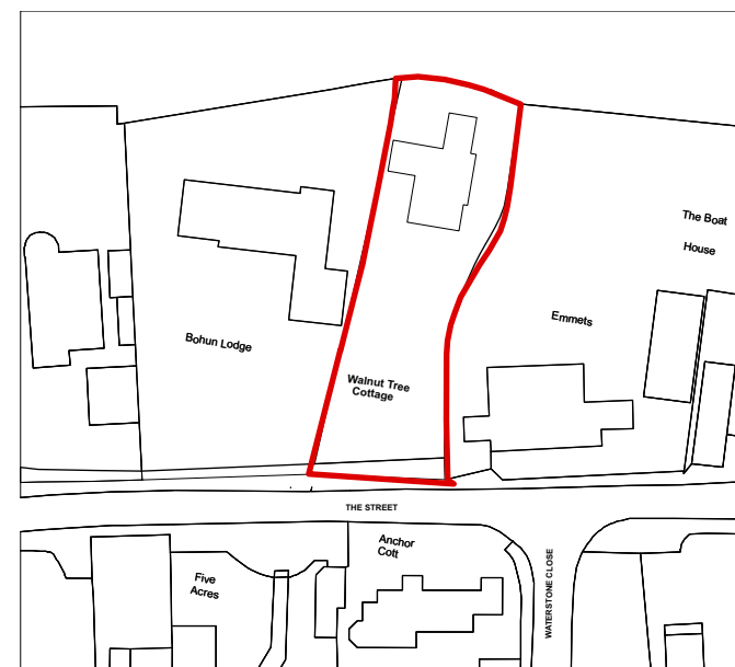
LOCATION PLAN Scale: 1:1250