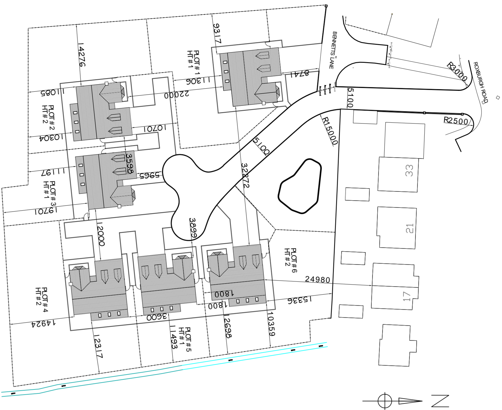
SITE SETTING OUT SCALE 1 : 500