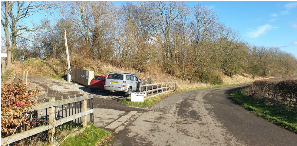
The newly created (stoned) campsite overflow carpark

If pub carpark is full please use the Campsite overflow carpark Please DO NOT park on the Public Highway