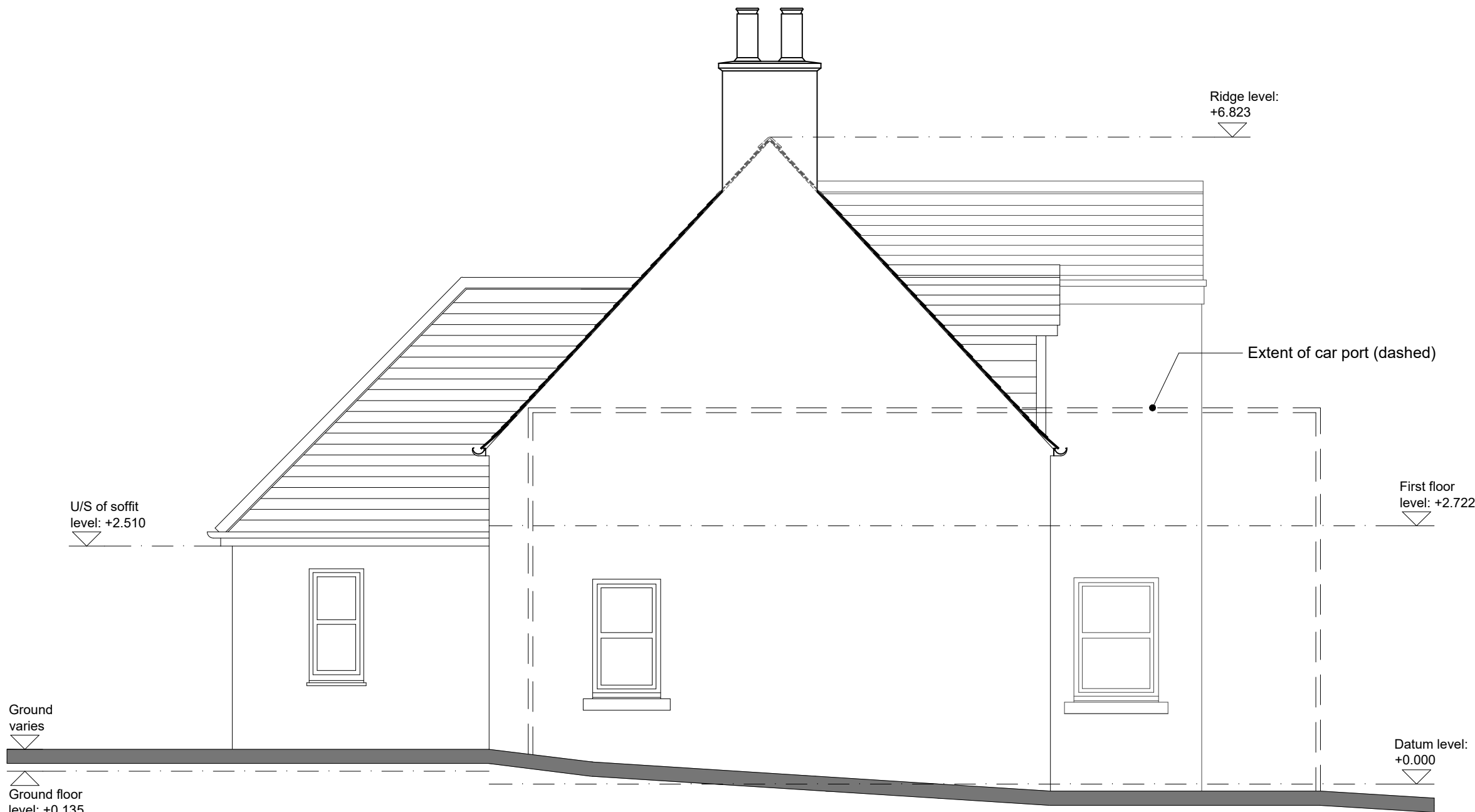
Proposed North West elevation @ 1:50 scale (no change)