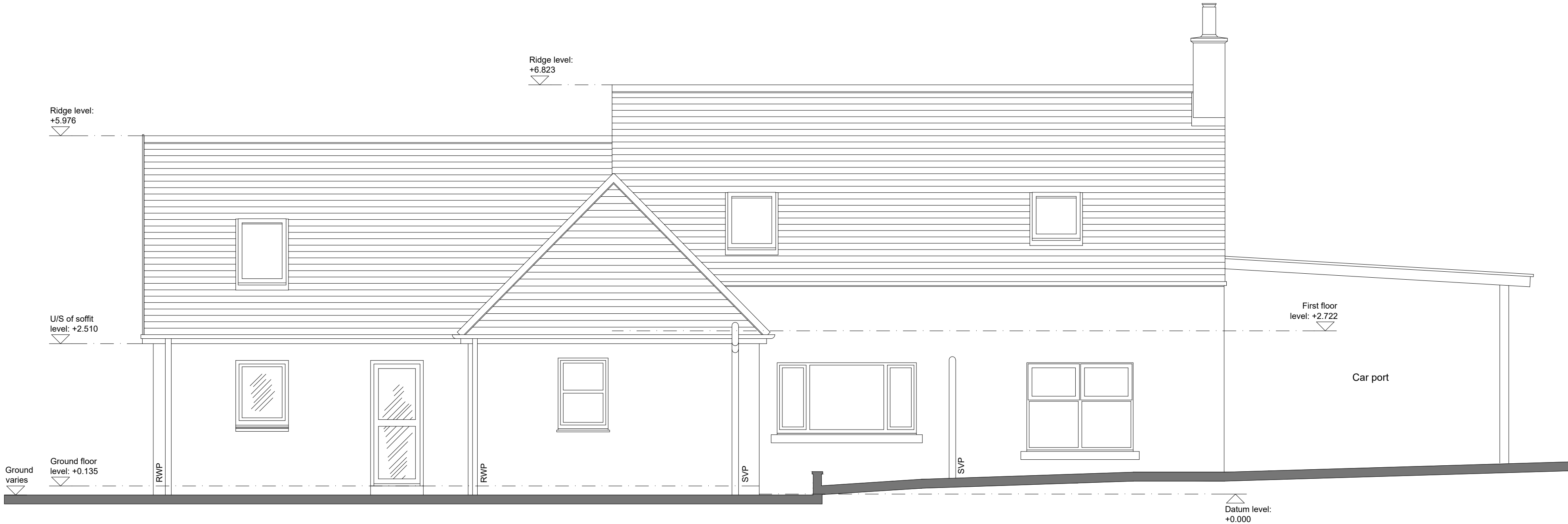
Proposed North East elevation @ 1:50 scale