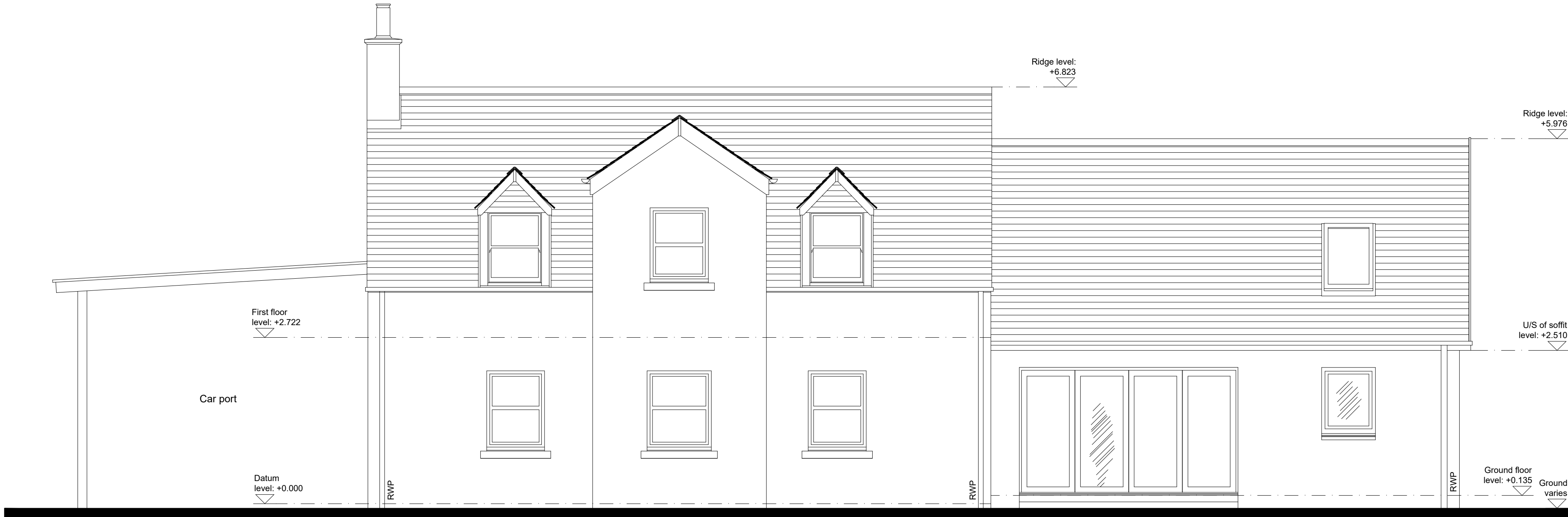
Proposed South West Elevation @ 1:50 scale

GENERAL NOTES: 1.) All dimensions are in millimetres unless stated otherwise. 2.) All levels are in metres above/below datum level. 3.) The contractor is responsible for checking all sizes prior to commencing works on site.