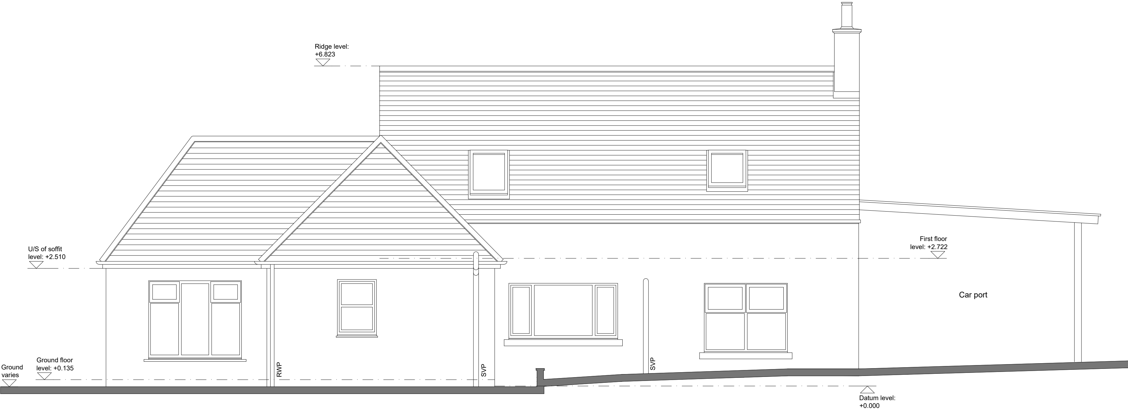
Existing North East elevation @ 1:50 scale