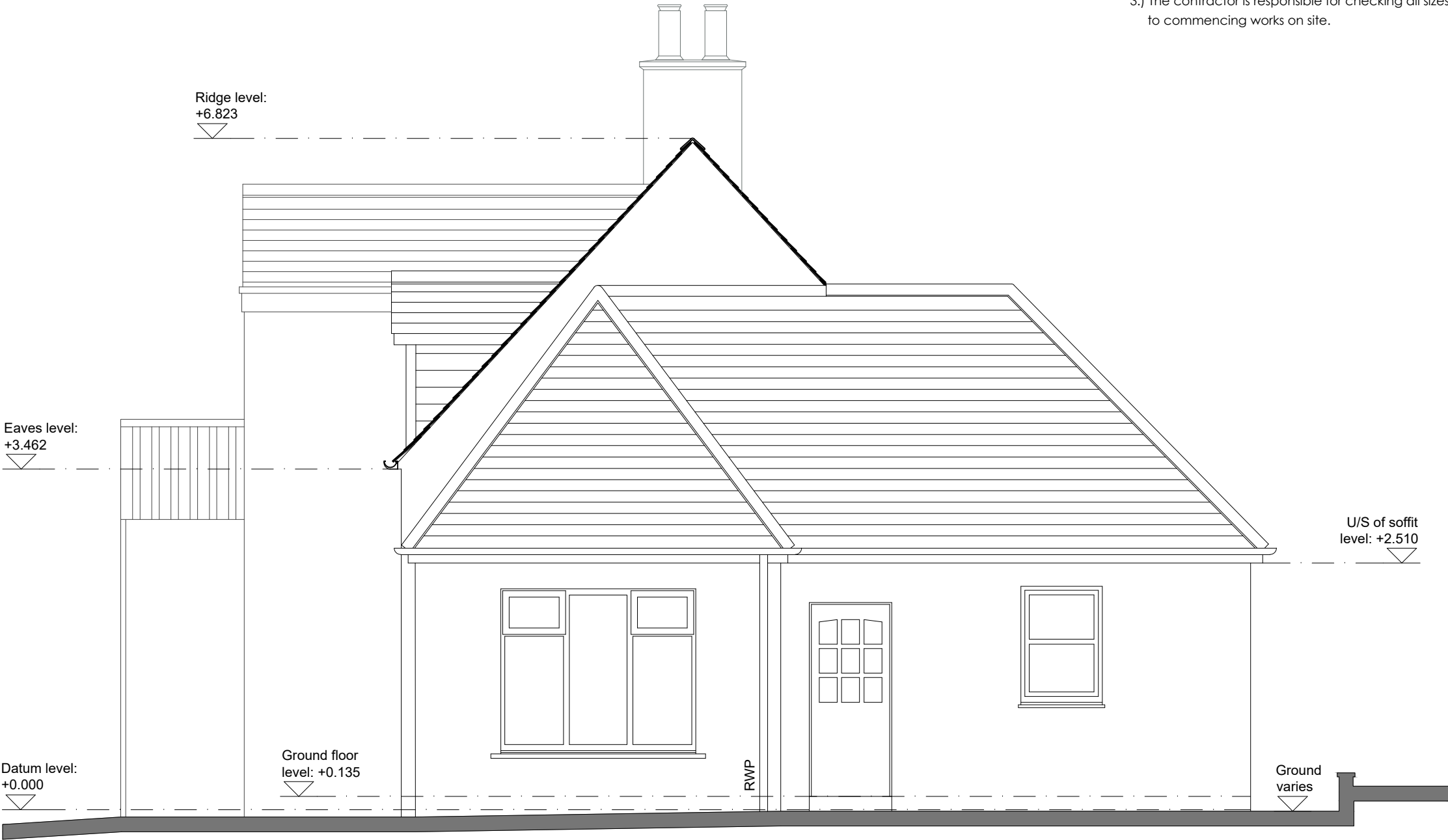
Existing South East elevation @ 1:50 scale