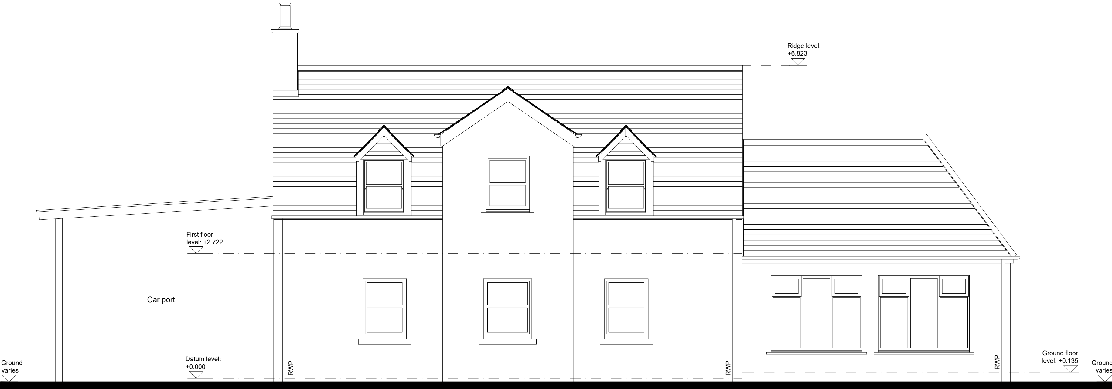
Existing South West @ 1:50 scale