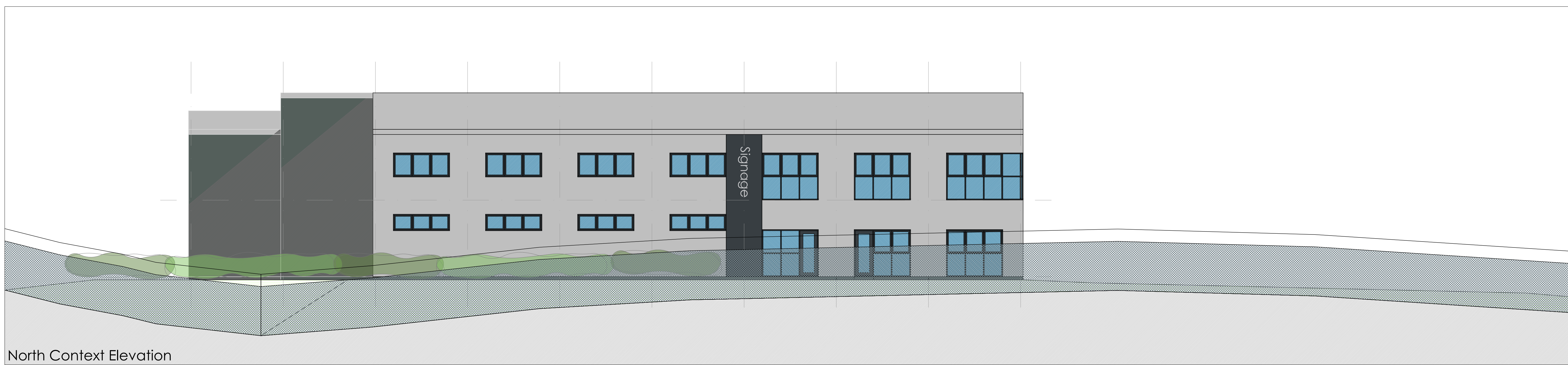
North Context Elevation