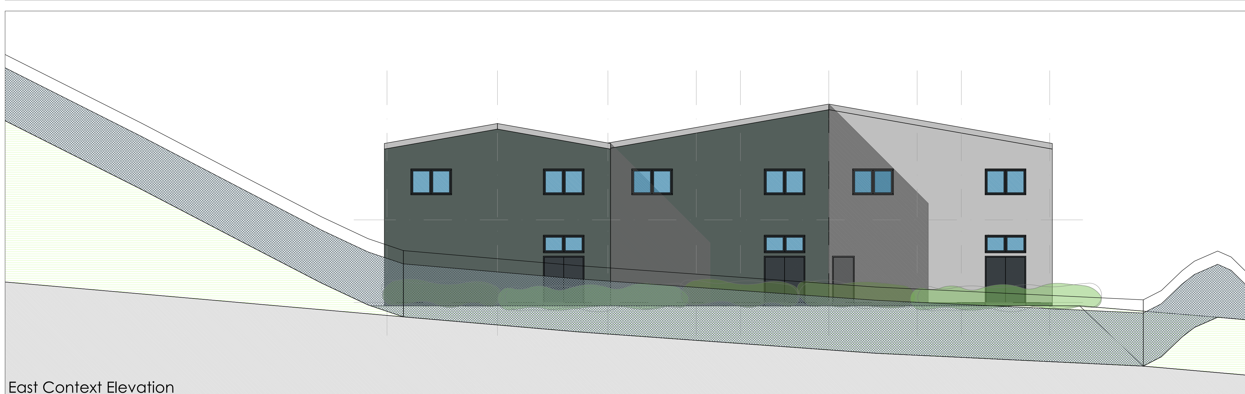
East Context Elevation