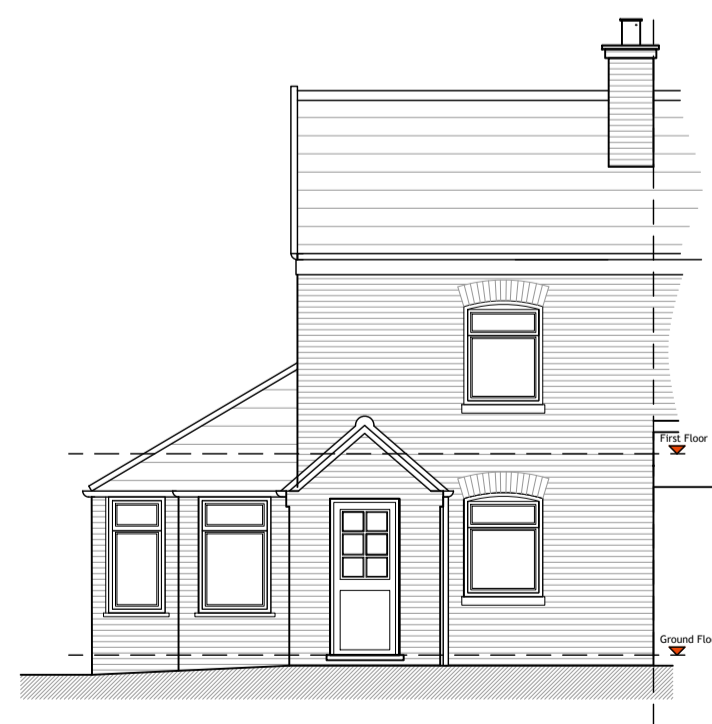
SOUTH ELEVATION (1:100)

NOTE: Adjacent properties based upon photographic information only.