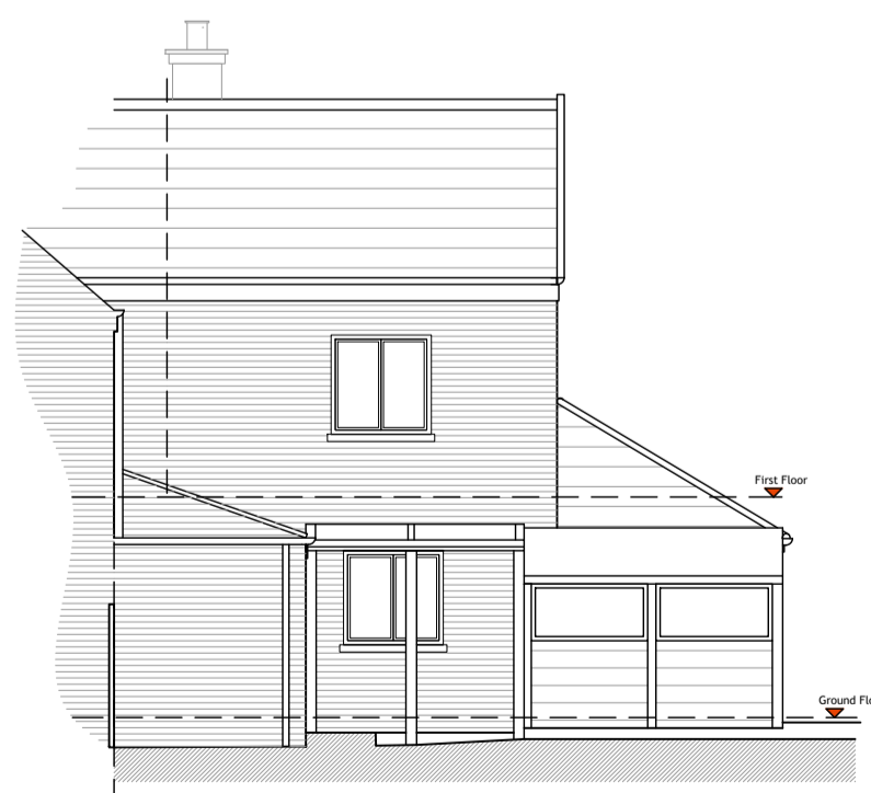
NORTH ELEVATION (1:100)