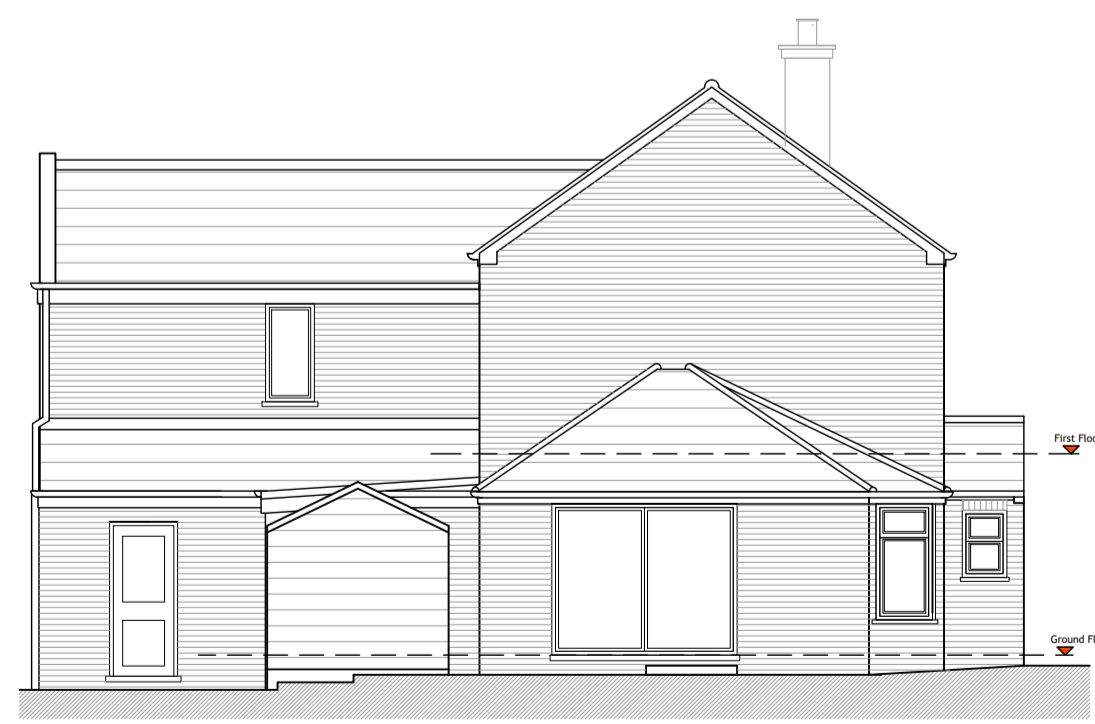
WEST ELEVATION (1:100)