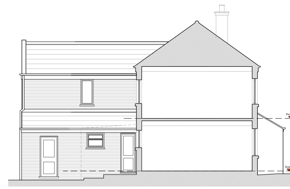
SECTION A (1:100)