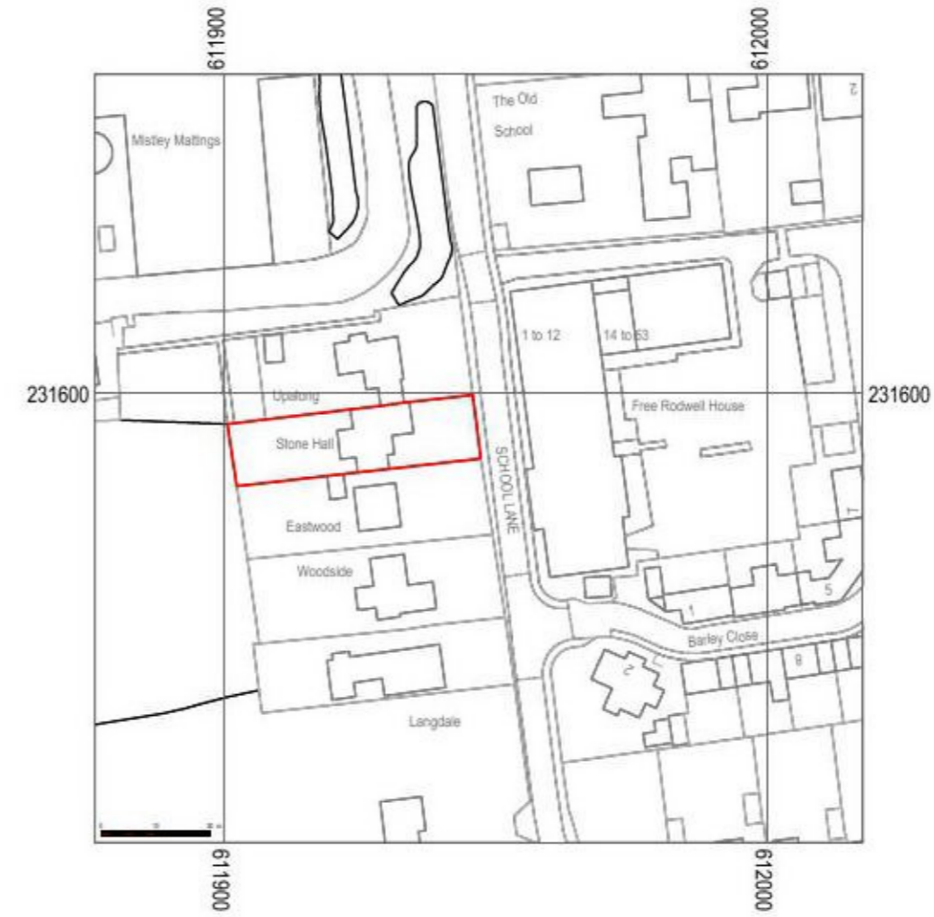
LOCATION PLAN - 1:1250