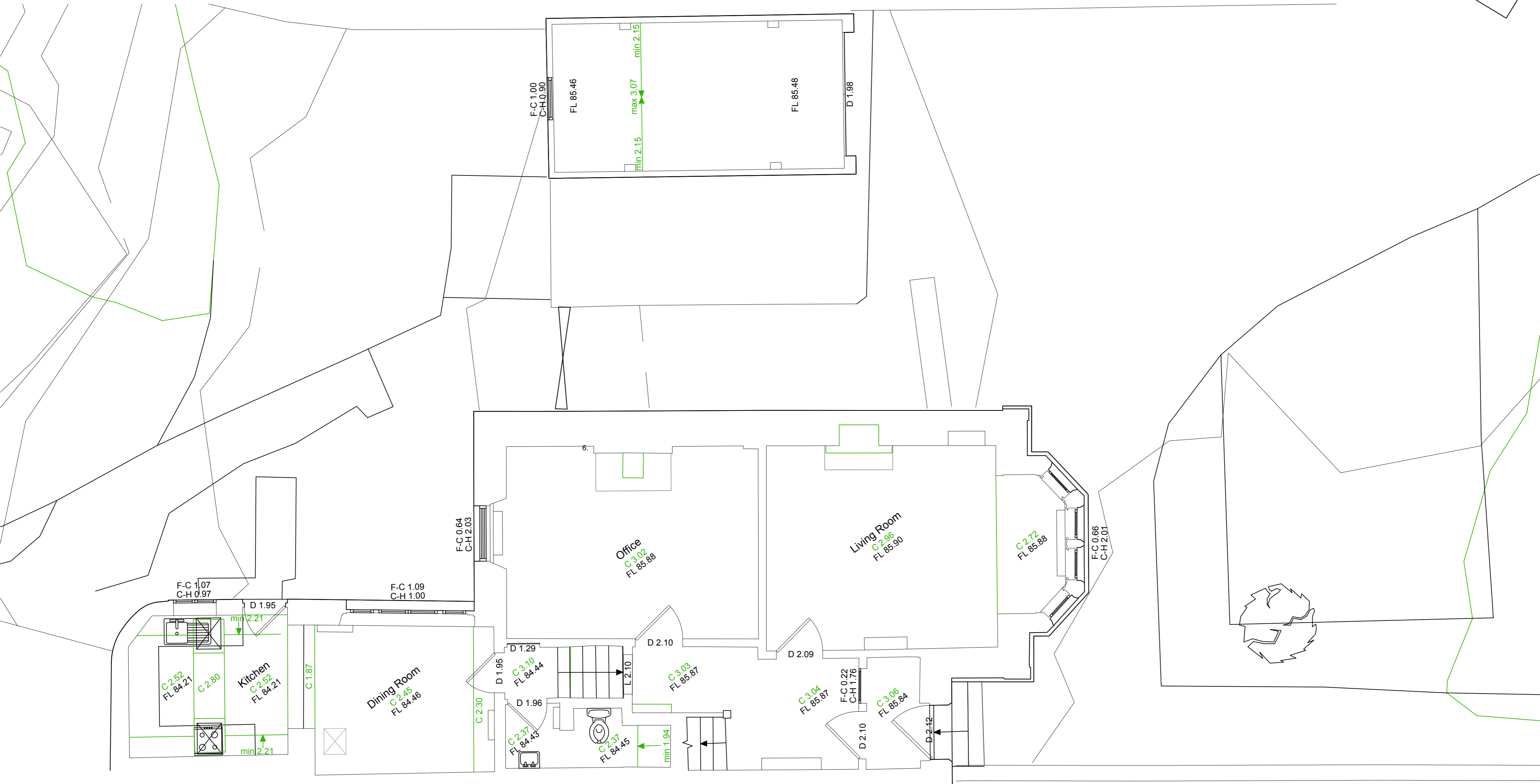
EXISTING GROUND FLOOR PLAN SCALE 1:50