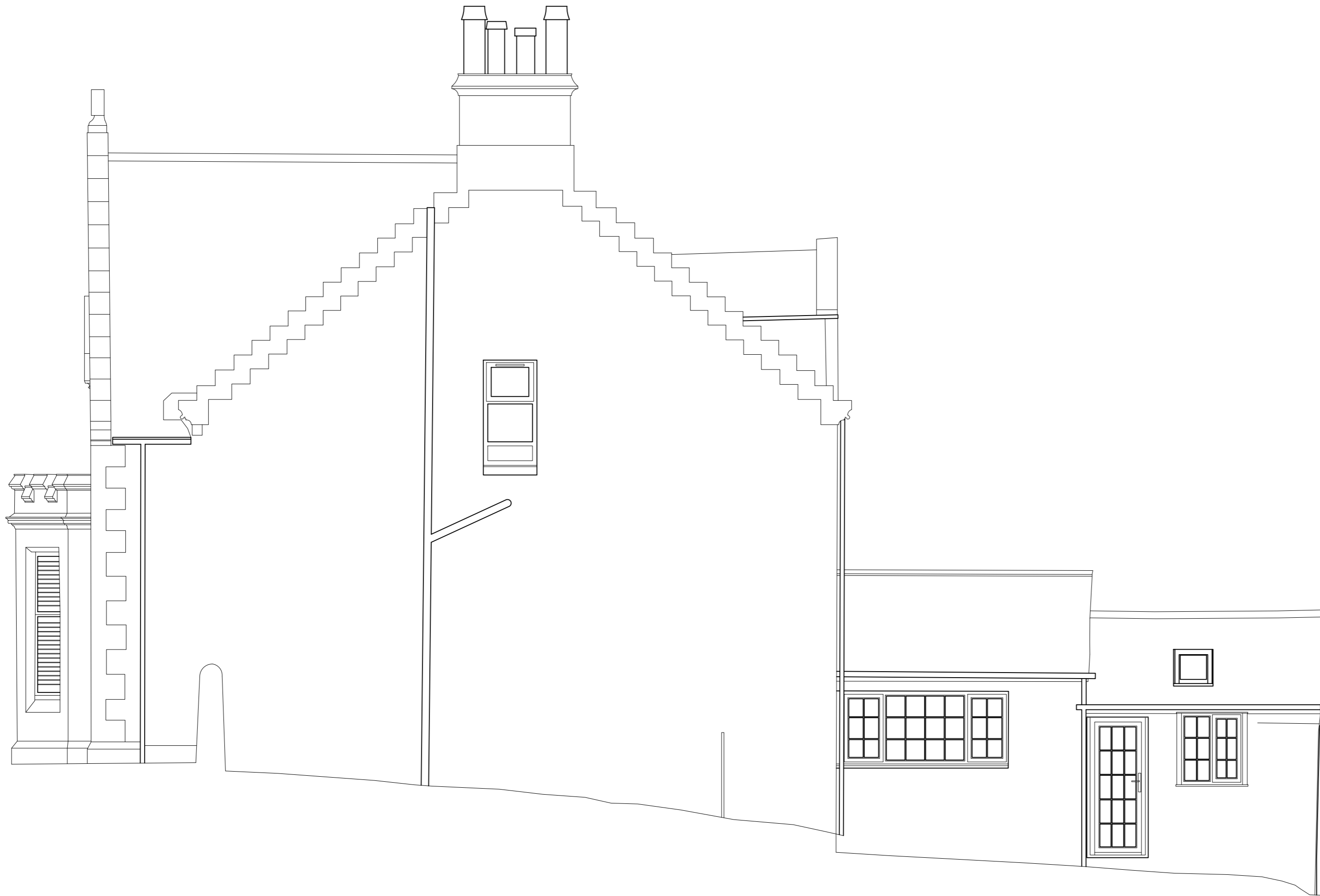
EXISTING SIDE ELEVATION SCALE 1:50