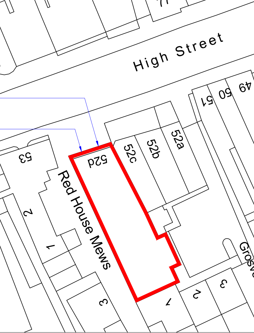
BLOCK PLAN Scale 1: 500