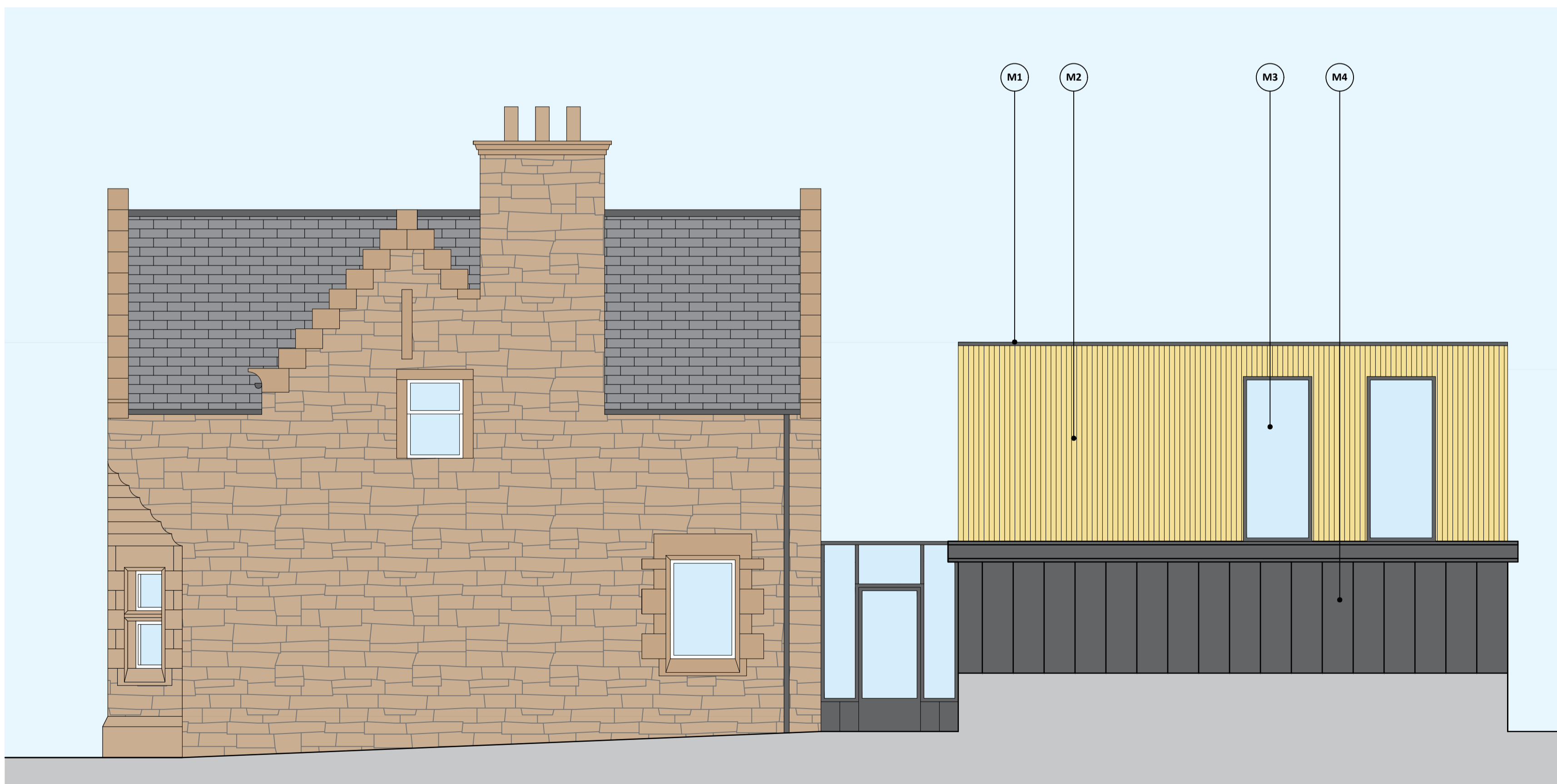
Proposed Rear Elevation (E4)