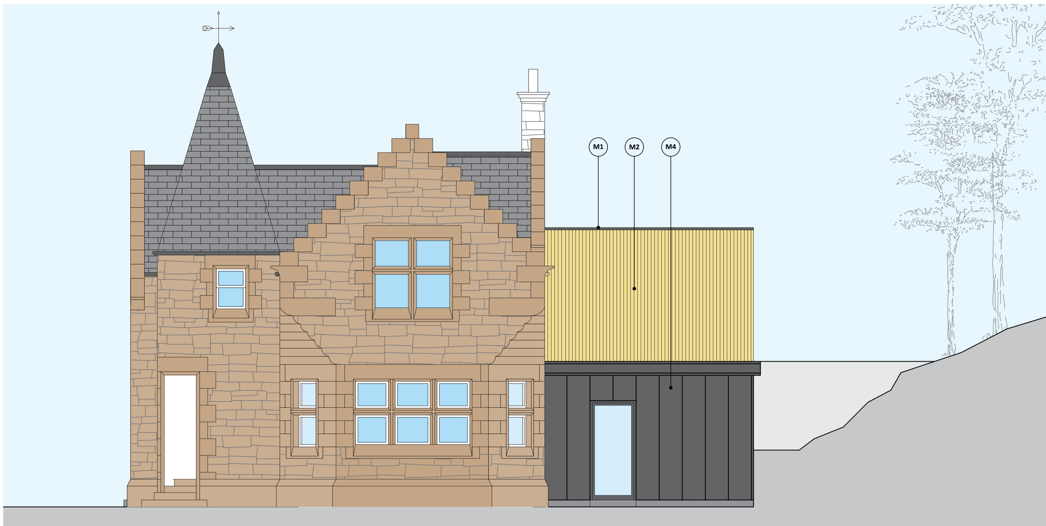
Proposed Front Elevation (E1)