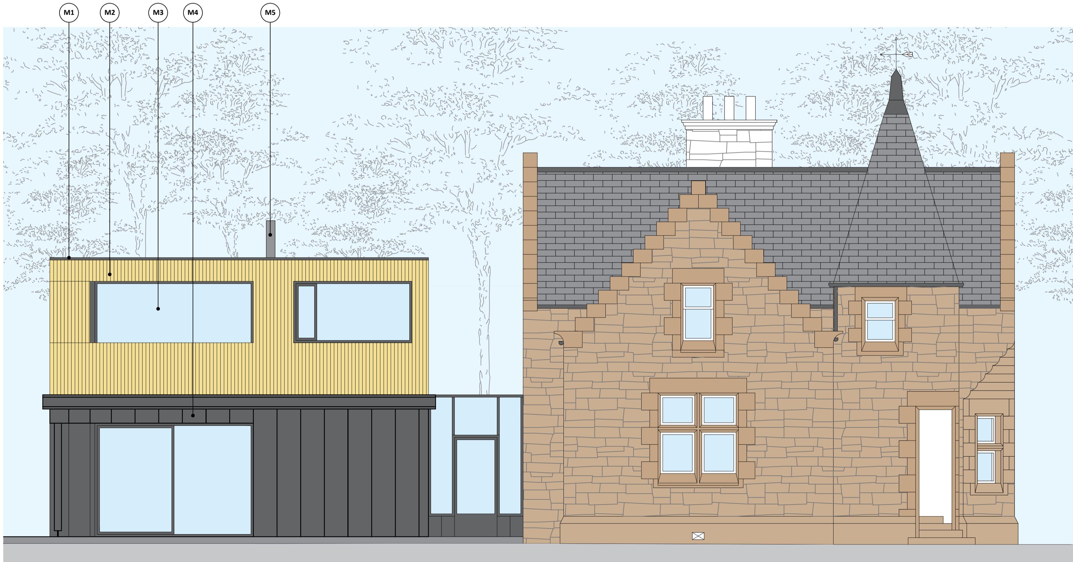
Proposed Side Elevation (E2)