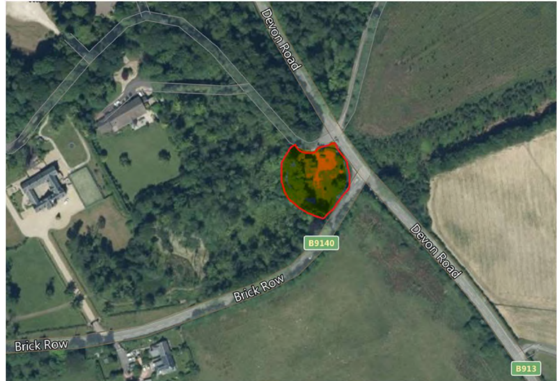
Image of site location

The proposed extension will provide more contemporary living and family space for the clients. Connection to the large garden is improved whilst better quality accommodation will be provided. This will allow the property as a whole, to function better as a family home.