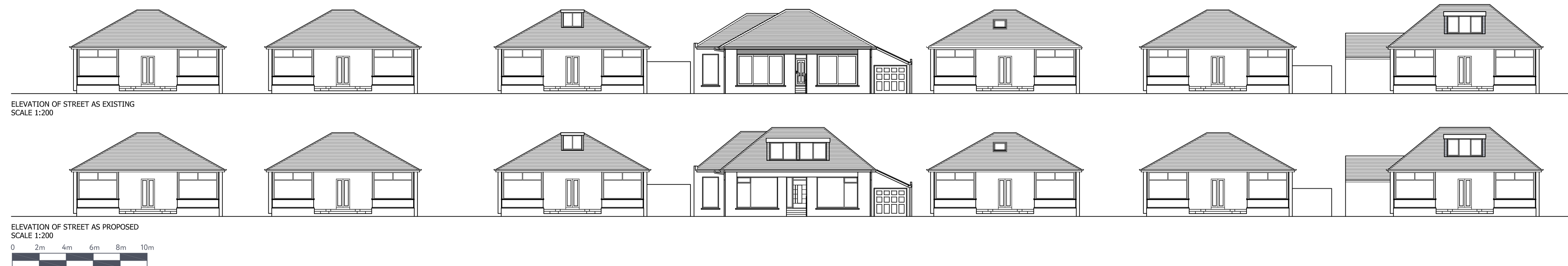
ELEVATION OF STREET AS EXISTING SCALE 1:200