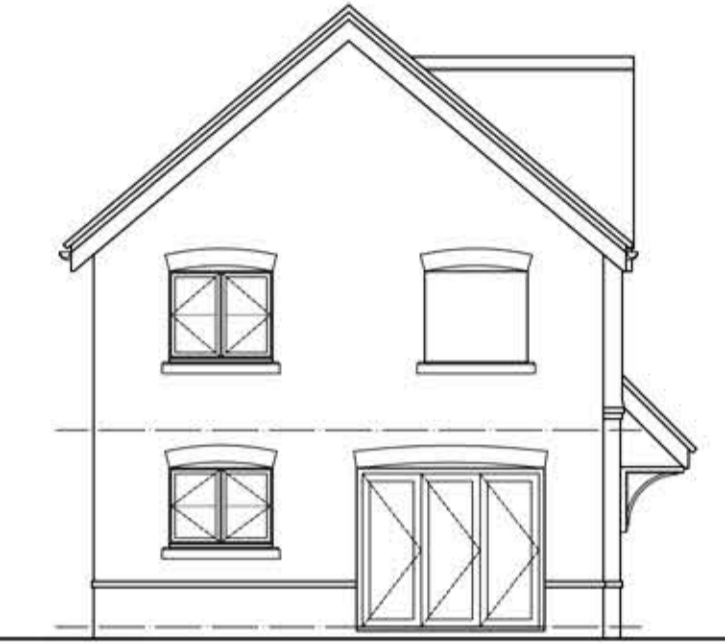
Proposed Side Elevation Scale 1:100

Notes GIA = 134sq/m [1442sq/ft] 4 Bedroom Detached House Materials Walls - Brick Roof - Brown Roof Tiles Cills - Stone Headers - Brick Windows - Anthracite Grey Doors - Anthracite Grey