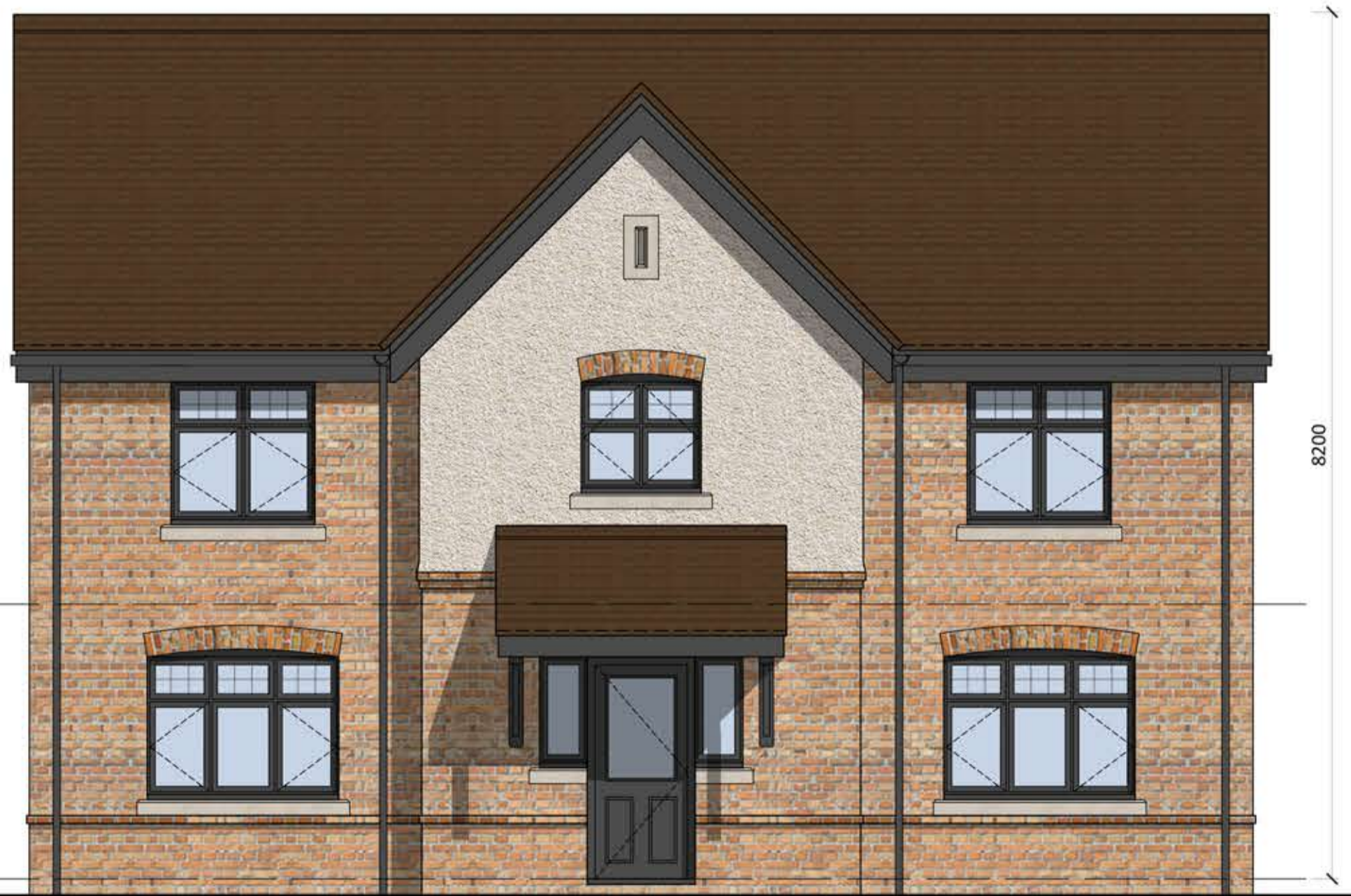
Proposed Front Elevation Scale 1:50

Notes GIA = 134sq/m [1442sq/ft] 4 Bedroom Detached House Materials Walls - Brick Roof - Brown Roof Tiles Cills - Stone Headers - Brick Windows - Anthracite Grey Doors - Anthracite Grey