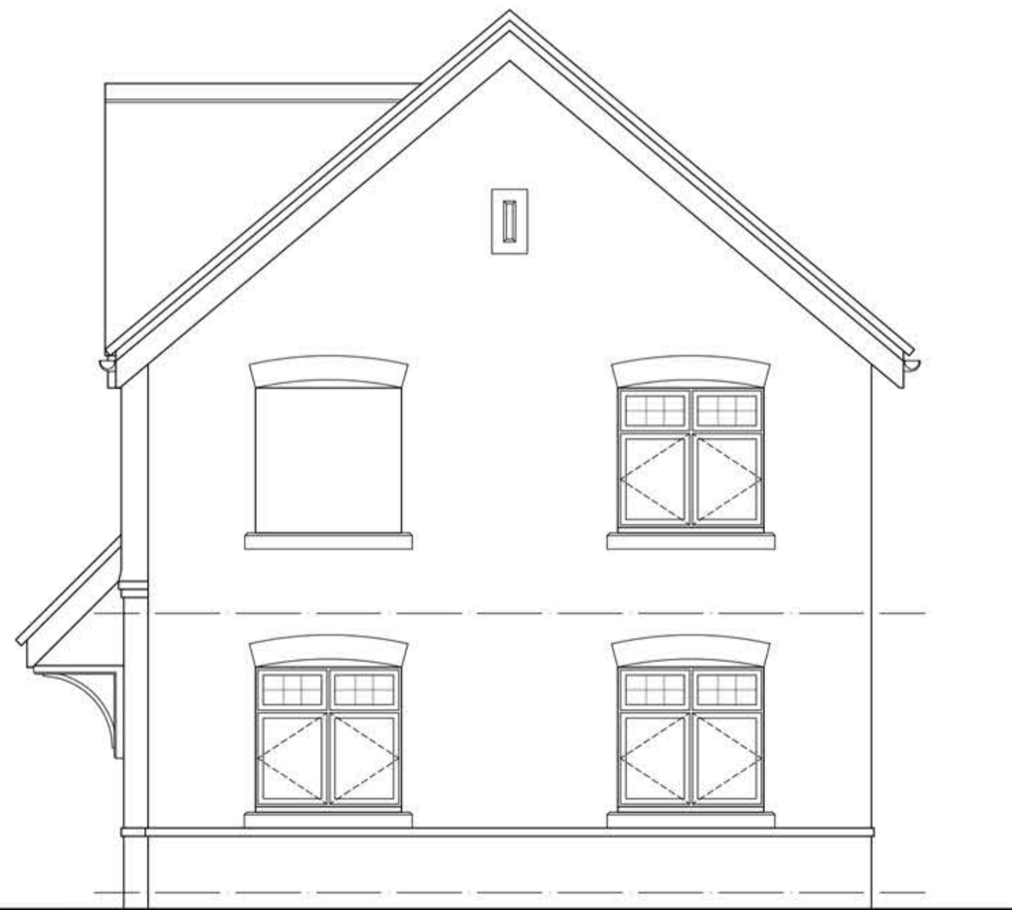
Proposed Side Elevation Scale 1:50