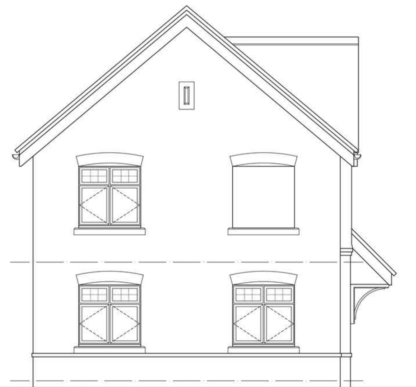
Proposed Side Elevation Scale 1:50