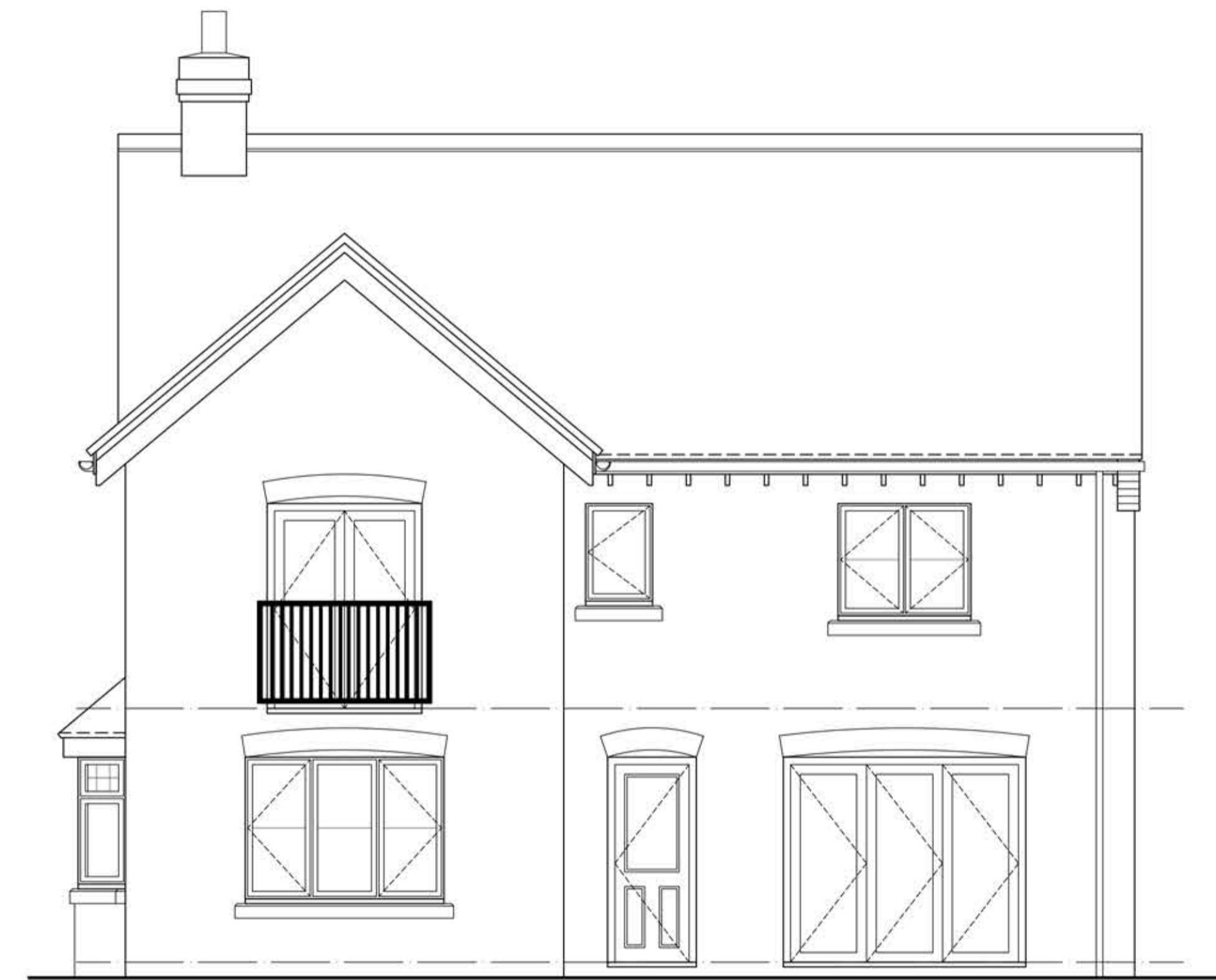
Proposed Rear Elevation Scale 1:50