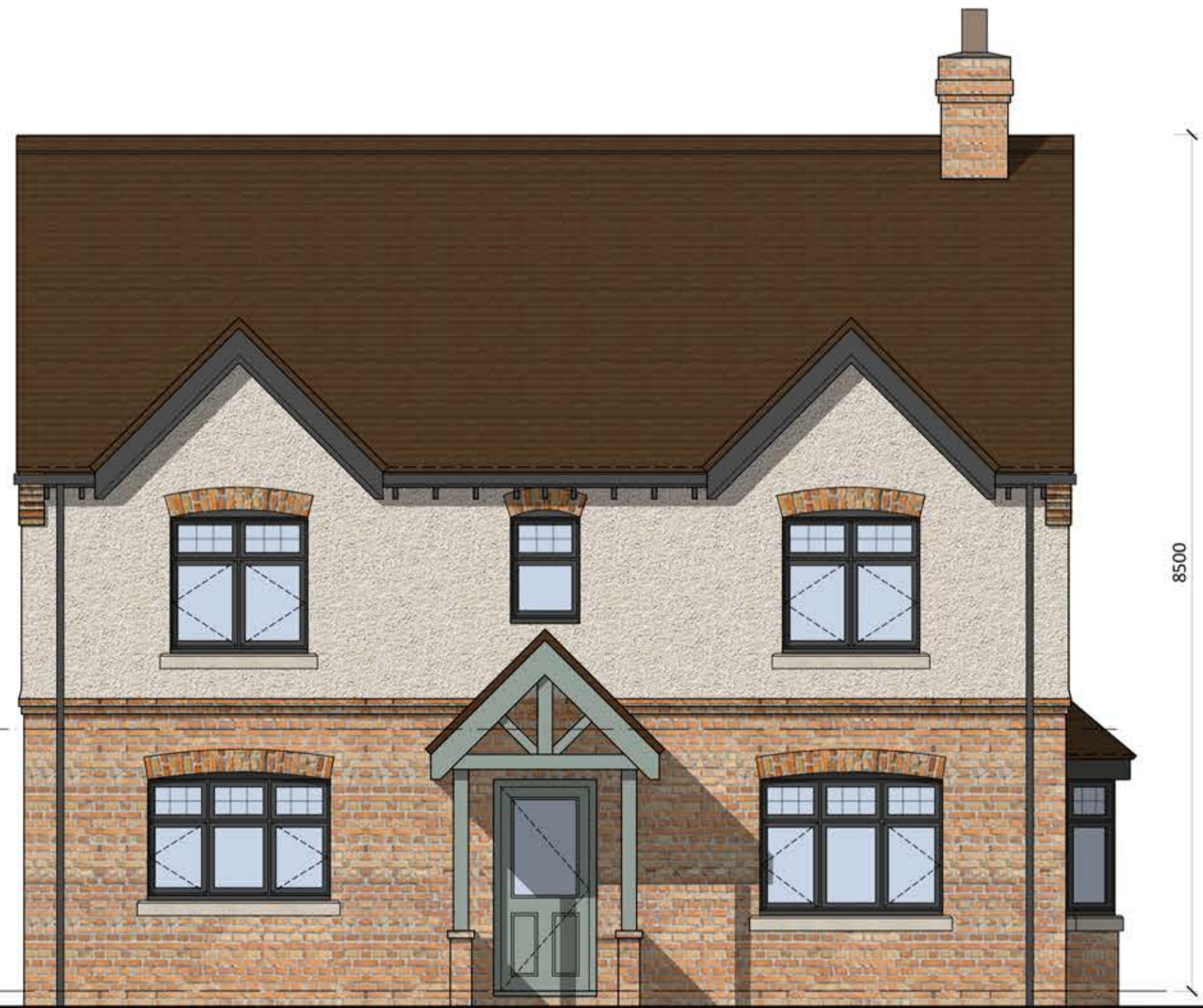
Proposed Front Elevation Scale 1:50