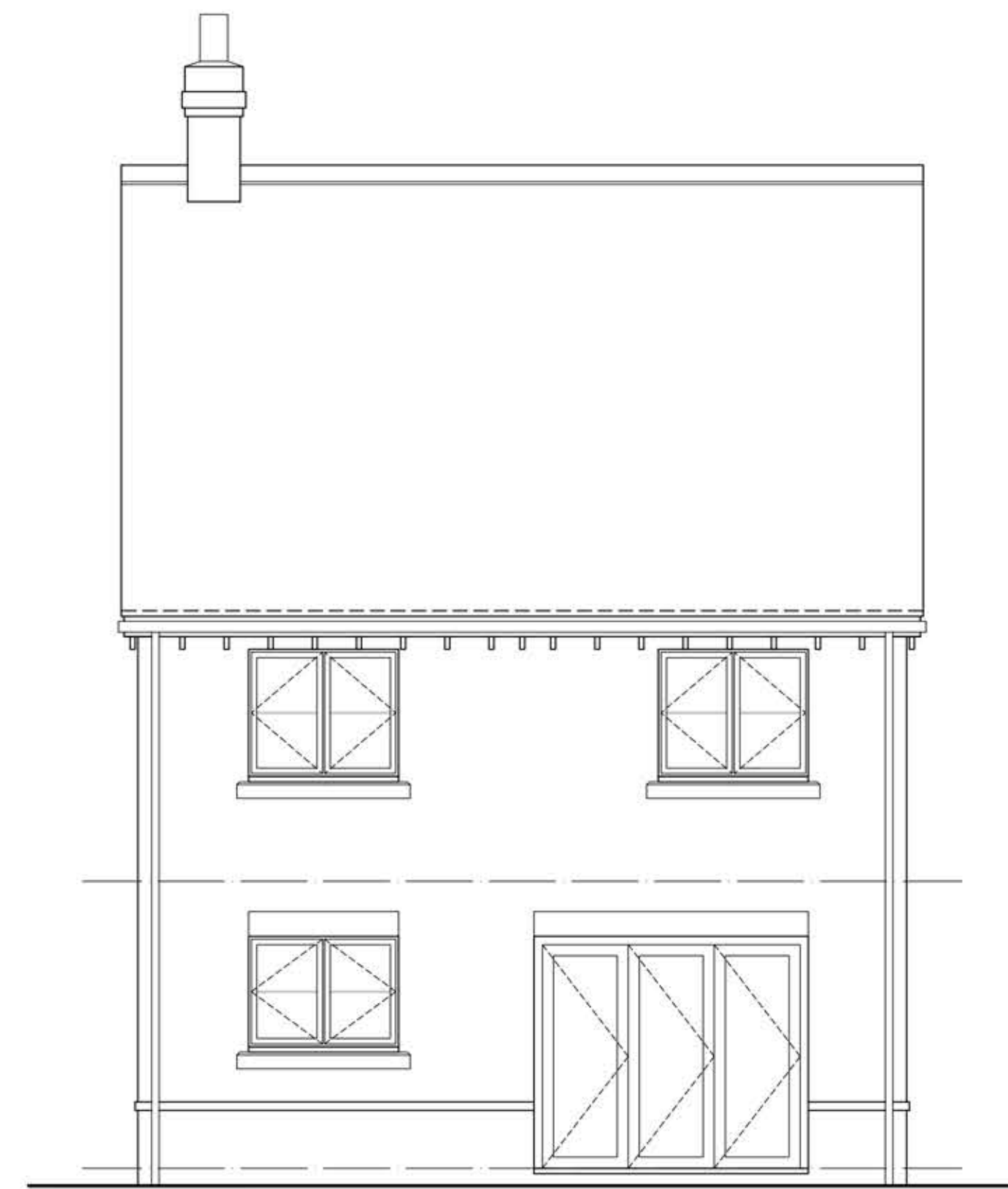
Proposed Rear Elevation Scale 1:50