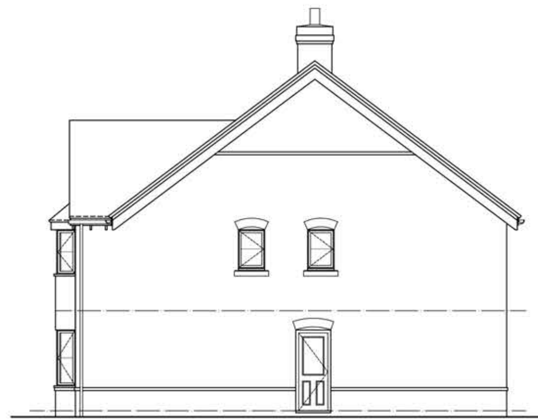
Proposed Side Elevation Scale 1:100