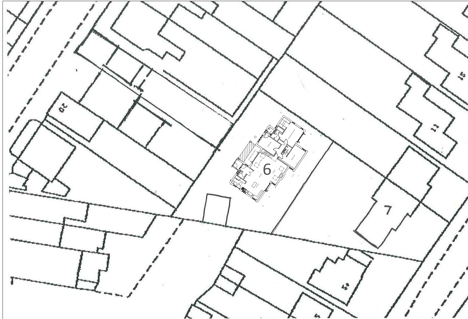
Site Plan 1:500 0m 10m 20m 30m

Do not scale from these drawings. All site dimensions to be checked by the contractor prior to commencement of works. Any errors to be reported as soon as possible. Drawings for obtaining Local Planning Consent or Building Regulations approvals only and do not constitute full working drawings. Any construction work carried out prior to receiving all necessary approvals is entirely at the householders risk.