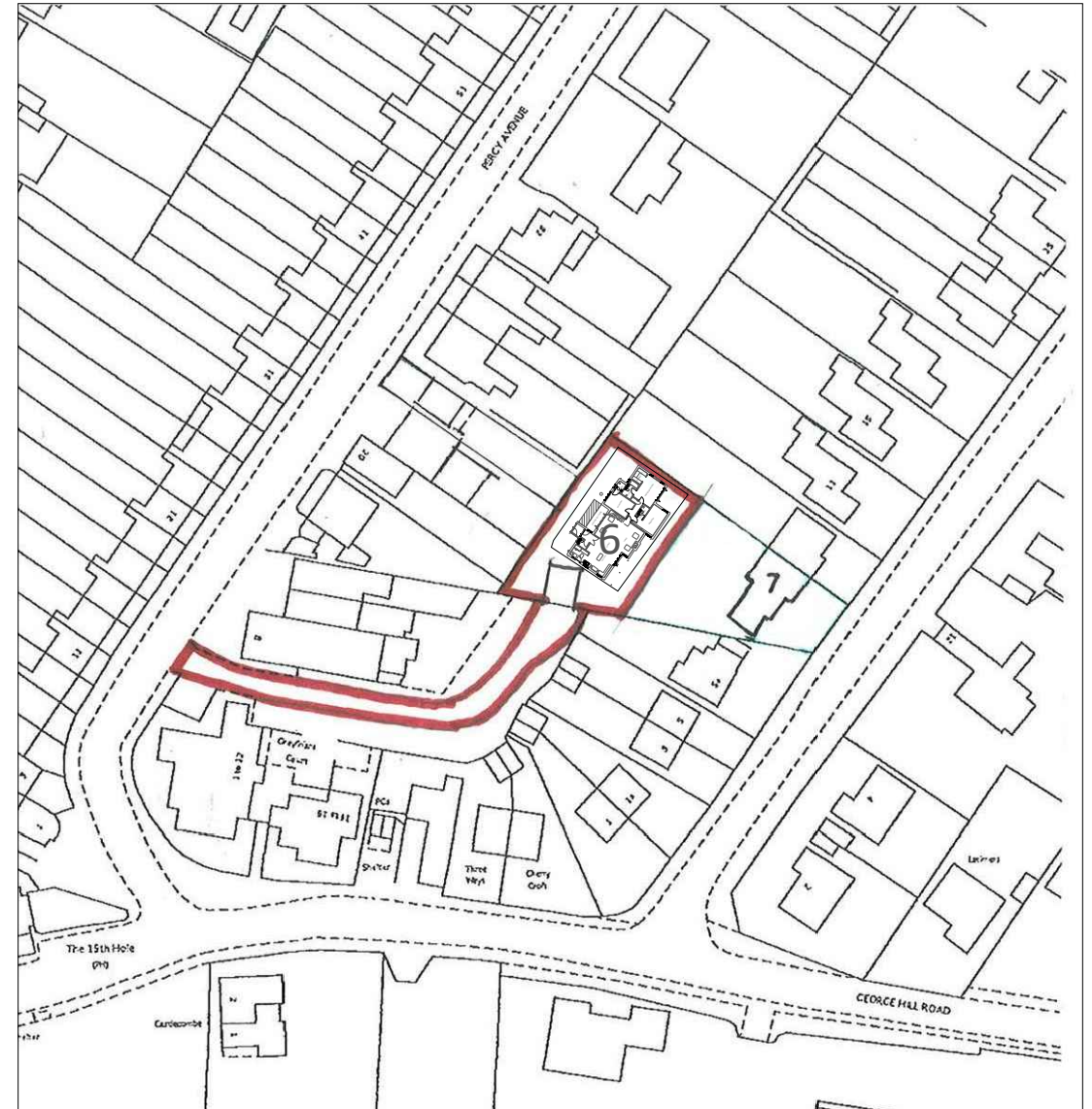
Location Plan 1:1250 0m 20m 40m 60m