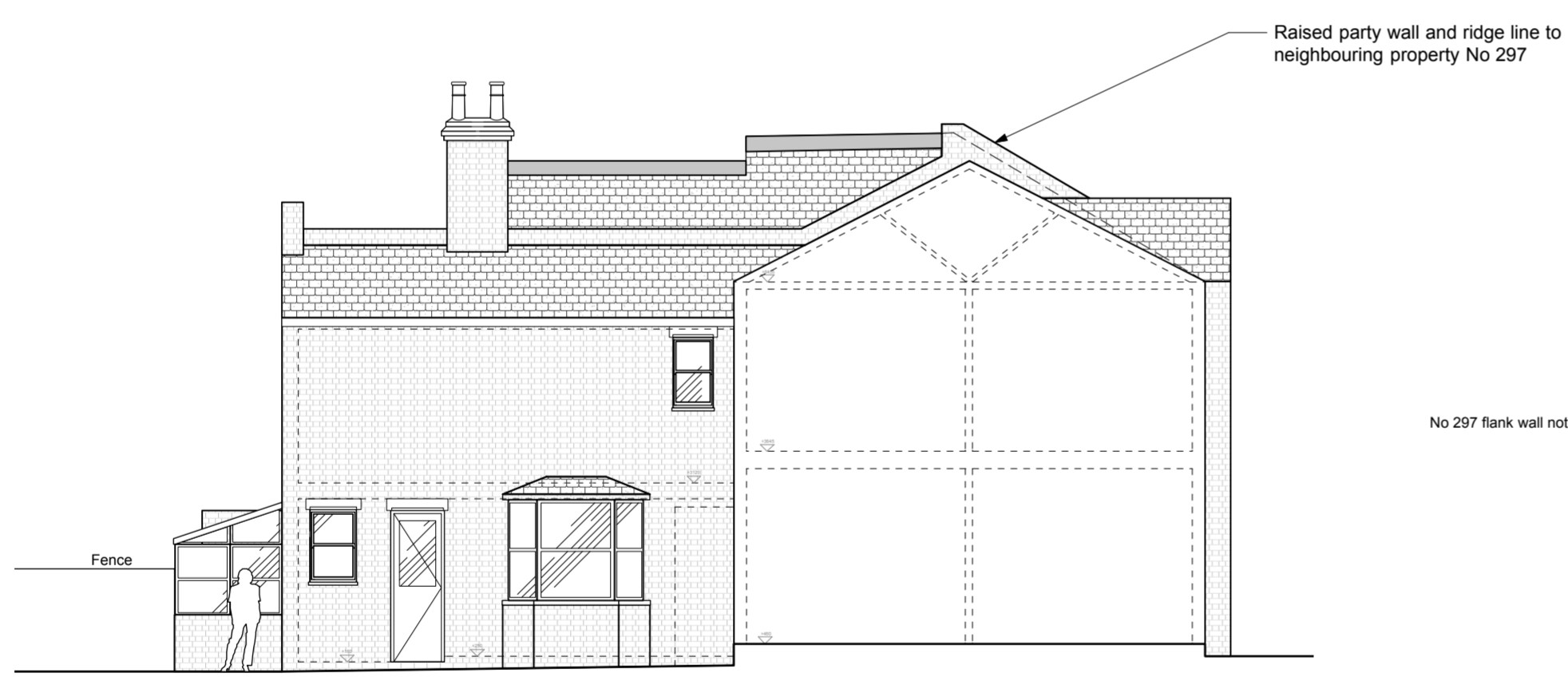
3. EXISTING SIDE ELEVATION AND SECTION THRU LOFT